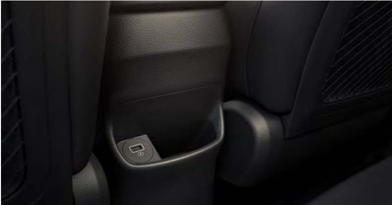
Rear USB charger standard on N Line, Premium and Ultimate trims.

The new KONA seamlessly connects you to your lifestyle with advanced technology at your fingertips.