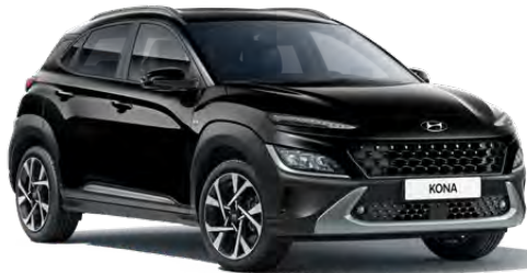
Phantom Black Pearl*