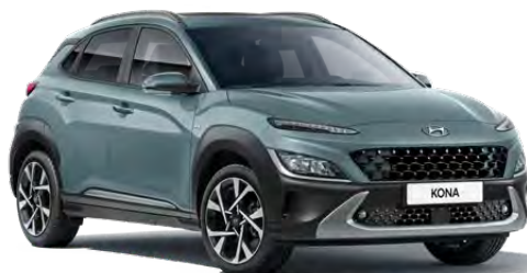
Jungle Green Pearl*