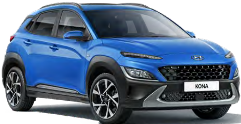
Surfy Blue Metallic*