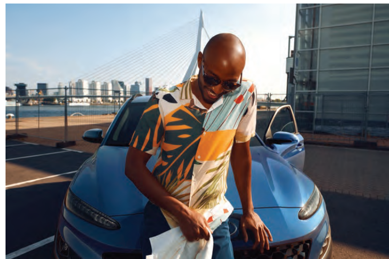
Car shown: new KONA Hybrid Ultimate in Surf Blue Metallic. Not to UK Specification.

Optimum power with low emissions from the 48V Mild Hybrid powertrain.