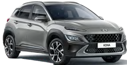
Cyber Grey Metallic*