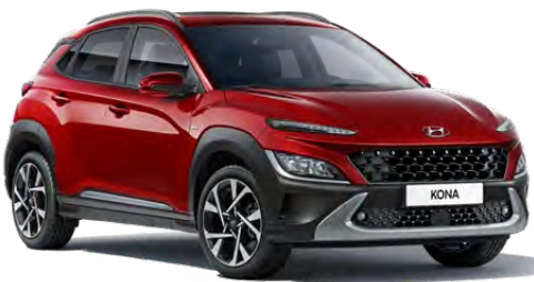
Pulse Red Pearl*