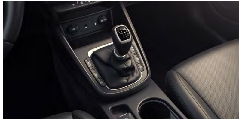
Six speed Intelligent Manual Transmission (iMT) standard on all 48V Mild Hybrid trims. Car shown is not to UK Specification.

Make every journey stand out with customisable sound, wireless charging, and ambient lighting — standard on N Line, Premium and Ultimate trims.