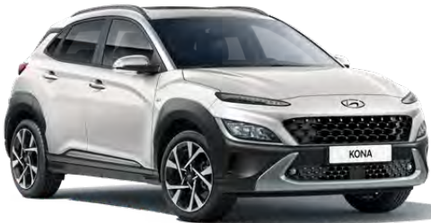
Atlas White Solid*