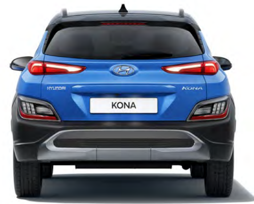
Car Shown: new KONA Ultimate in Surf Blue Metallic. Not to UK specification.

Welcome to the new KONA from Hyundai – with bold styling, advanced technology, comprehensive connectivity and enhanced fuel efficiency thanks to a choice of Hybrid and 48V Mild Hybrid engines.