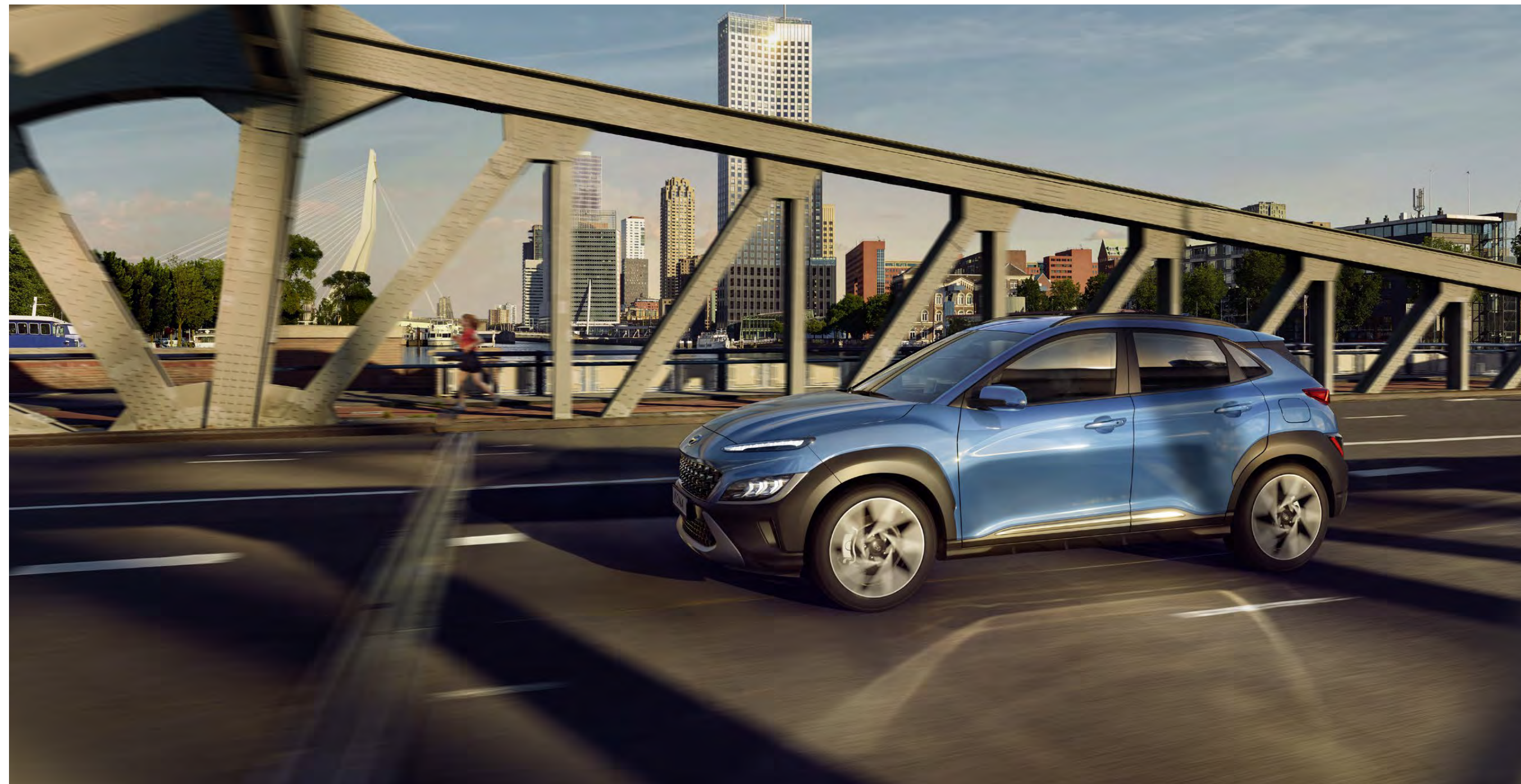
Car shown: new KONA Hybrid Ultimate in Surfy Blue Metallic. Not to UK Specification.

Giving you the best of both worlds, the new KONA Hybrid is equipped with both a petrol engine and an electric motor, working together with the support of a powerful battery to deliver performance on demand, excellent fuel economy and reduced emissions.