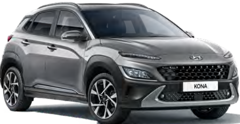
Galactic Grey Metallic*