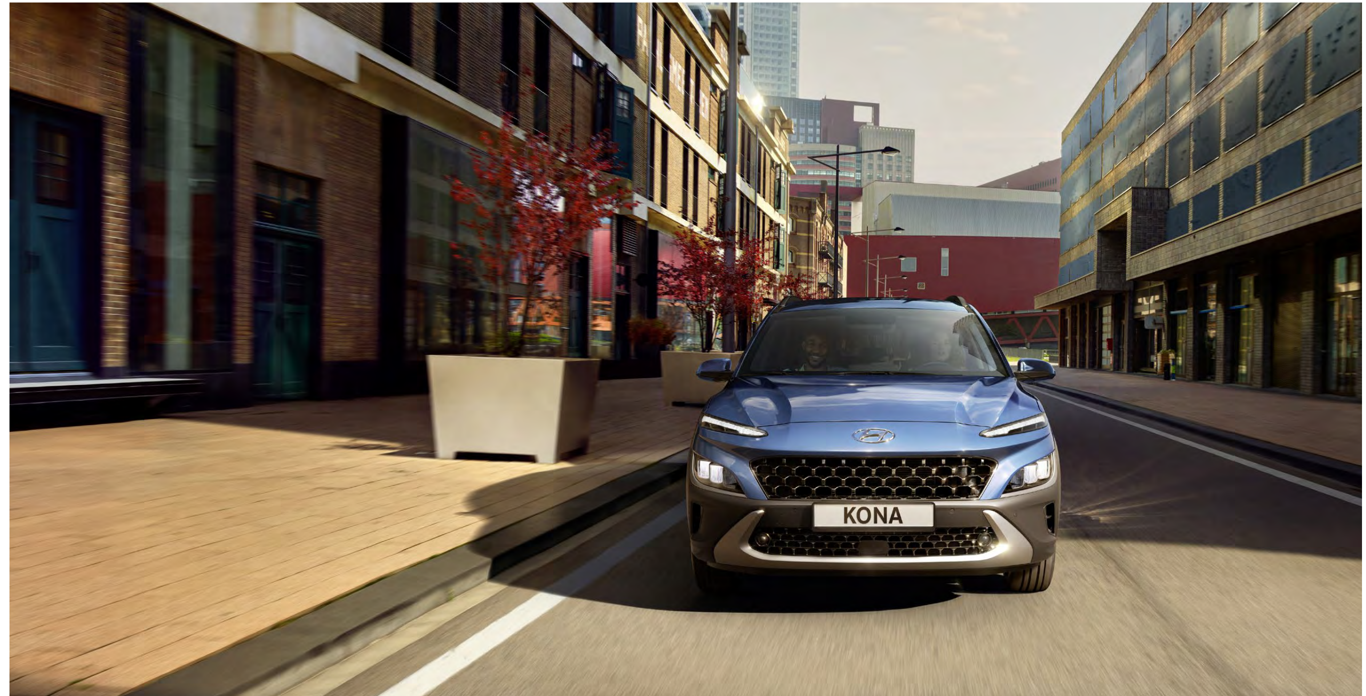
Car shown: new KONA Hybrid Ultimate in Surf Blue Metallic. Not to UK Specification.