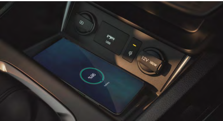
*Wireless Phone Charging Pad standard on N Line, Premium and Ultimate trims.