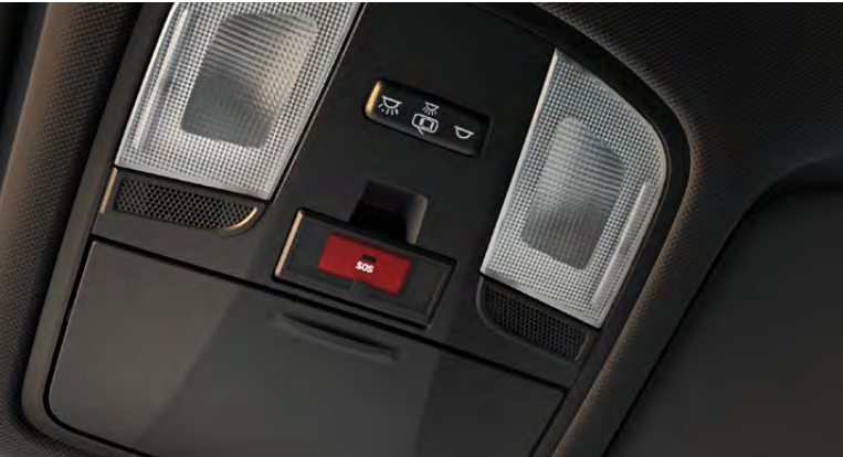
eCall standard across all trims.