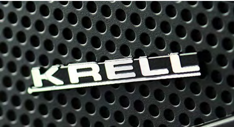
†KRELL premium audio standard on N Line, Premium and Ultimate trims.

Take your life with you, with advanced connectivity onboard the new KONA. Apple CarPlay™ and Android Auto™ allow your smartphone to be seamlessly synced whilst the large central touchscreen will mirror your apps and playlists for easy access. Wireless charging* gives you clutter-free power at all times, whilst USB ports in the rear of the N Line, Premium and Ultimate trims make sure passengers also have access to power. BlueLink** connected car services give mobile-based communication and control to keep you in touch, and the smartphone-synced KRELL† premium audio system gives a fully personalised environment with high definition dynamic sound from 8 speakers throughout the interior.