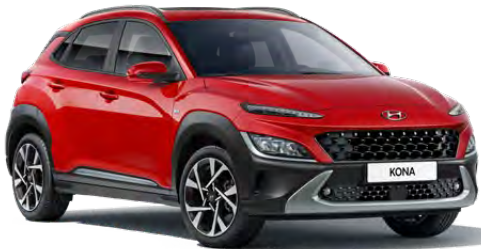
Ignite Red Solid*