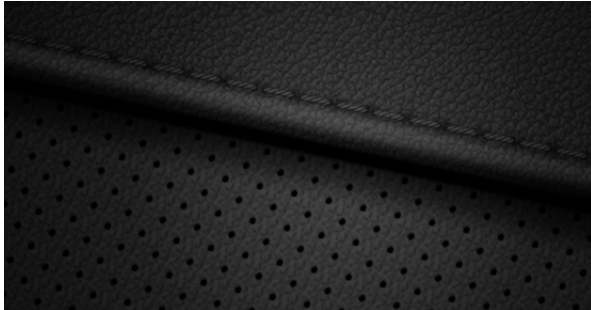
Black Leather Standard on Ultimate trim.