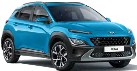
Dive Blue Solid (No-cost option)

Choose from a range of vibrant modern colours on the new KONA.