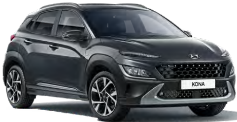
Dark Knight Grey Pearl*