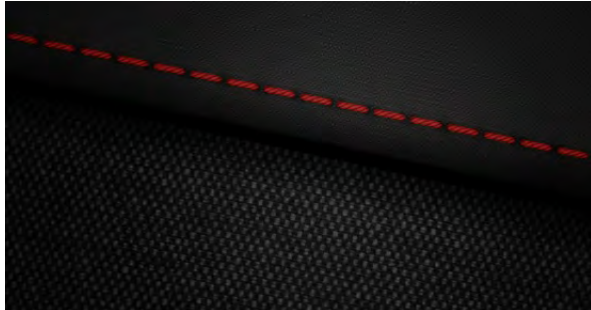
N Line Cloth – Red Stitching Standard on N Line trim.