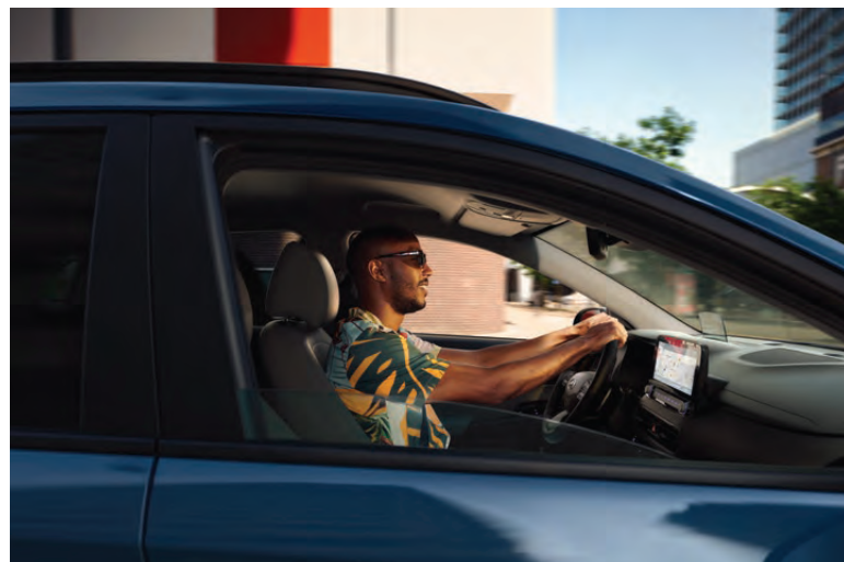
Car shown: new KONA Hybrid Ultimate in Surfy Blue Metallic. Not to UK Specification.

Packing a punch with the new 1.6 GDi Hybrid engine, the new KONA Hybrid delivers 141 PS of power via the flexible 6-speed Dual Clutch transmission.