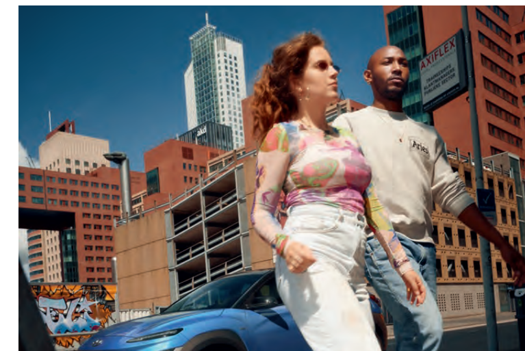
Car shown: new KONA Hybrid Ultimate in Surfy Blue Metallic. Not to UK Specification.

Refined styling for a modern approach to driving. Upgraded throughout, the new KONA exemplifies modern design.