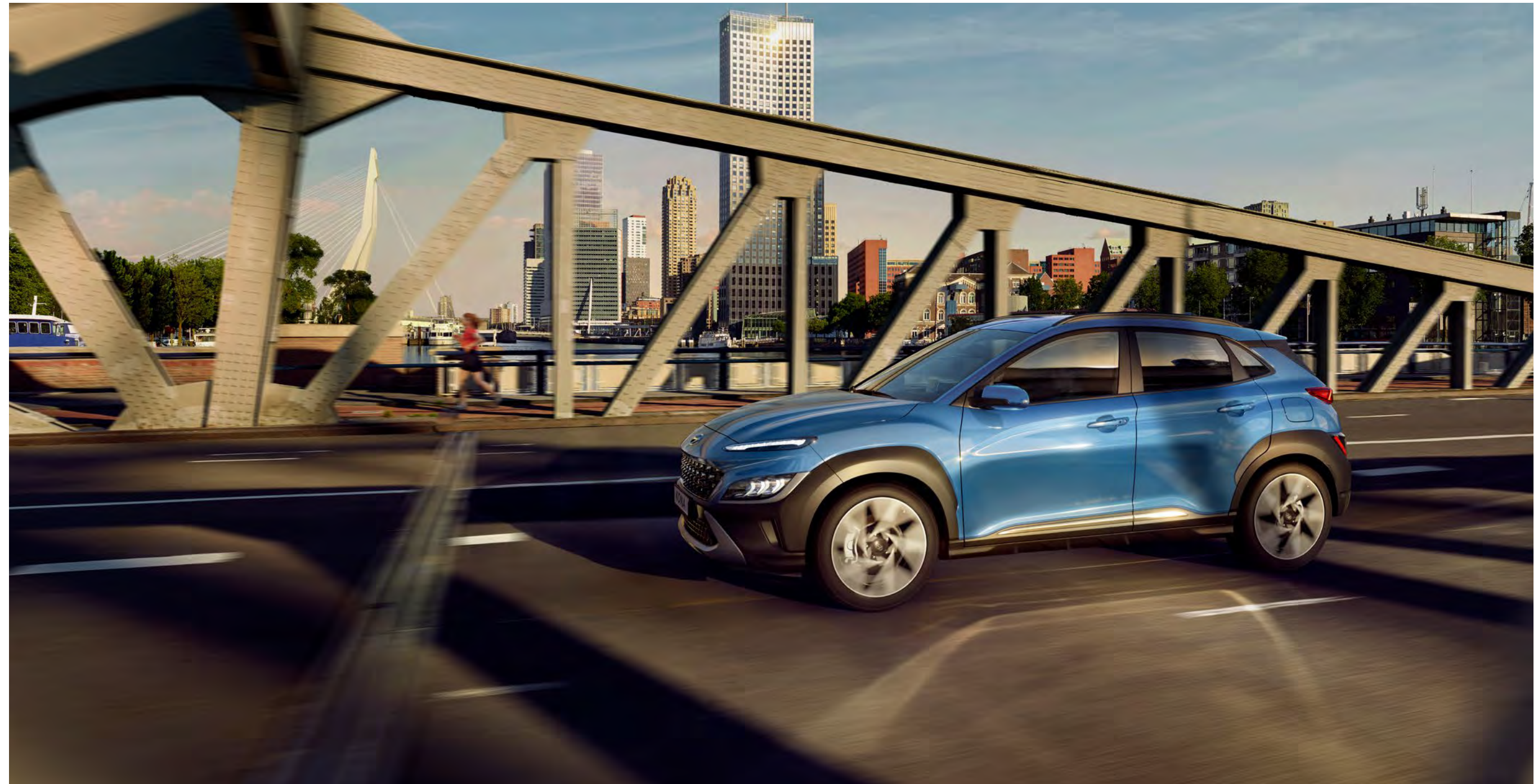
Car shown: KONA Hybrid Ultimate in Surf Blue Metallic. Not to UK Specification. Colour choice may vary and is subject to availability.

Giving you the best of both worlds, the KONA Hybrid is equipped with both a petrol engine and an electric motor, working together with the support of a powerful battery to deliver performance on demand, excellent fuel economy and reduced emissions.