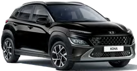
Abyss Black Pearl*