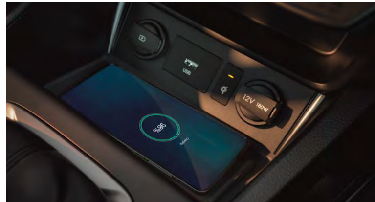
**Wireless Phone Charging Pad standard on N Line, Premium and Ultimate trims.