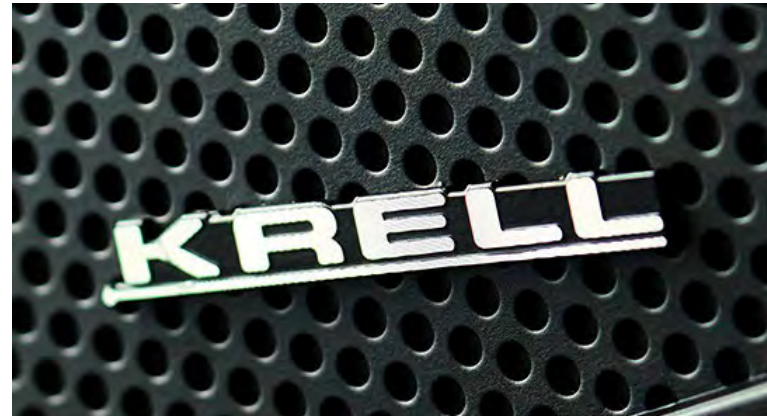
*KRELL premium audio standard on N Line, Premium and Ultimate trims.

Mobile connectivity with Apple CarPlay™ and Android Auto™ allows multiple handsets to be connected via Bluetooth®. Smart Voice Interaction gives you integrated vehicle control, and wireless smartphone charging** means you're cable-free. Our on board KRELL* sound system features eight custom speakers to provide an immersive audio experience. Bluelink® connected car services includes Last Mile Navigation and a new user profile feature. Users can locate their vehicle or view vehicle attributes like fuel level, via the Bluelink® app.