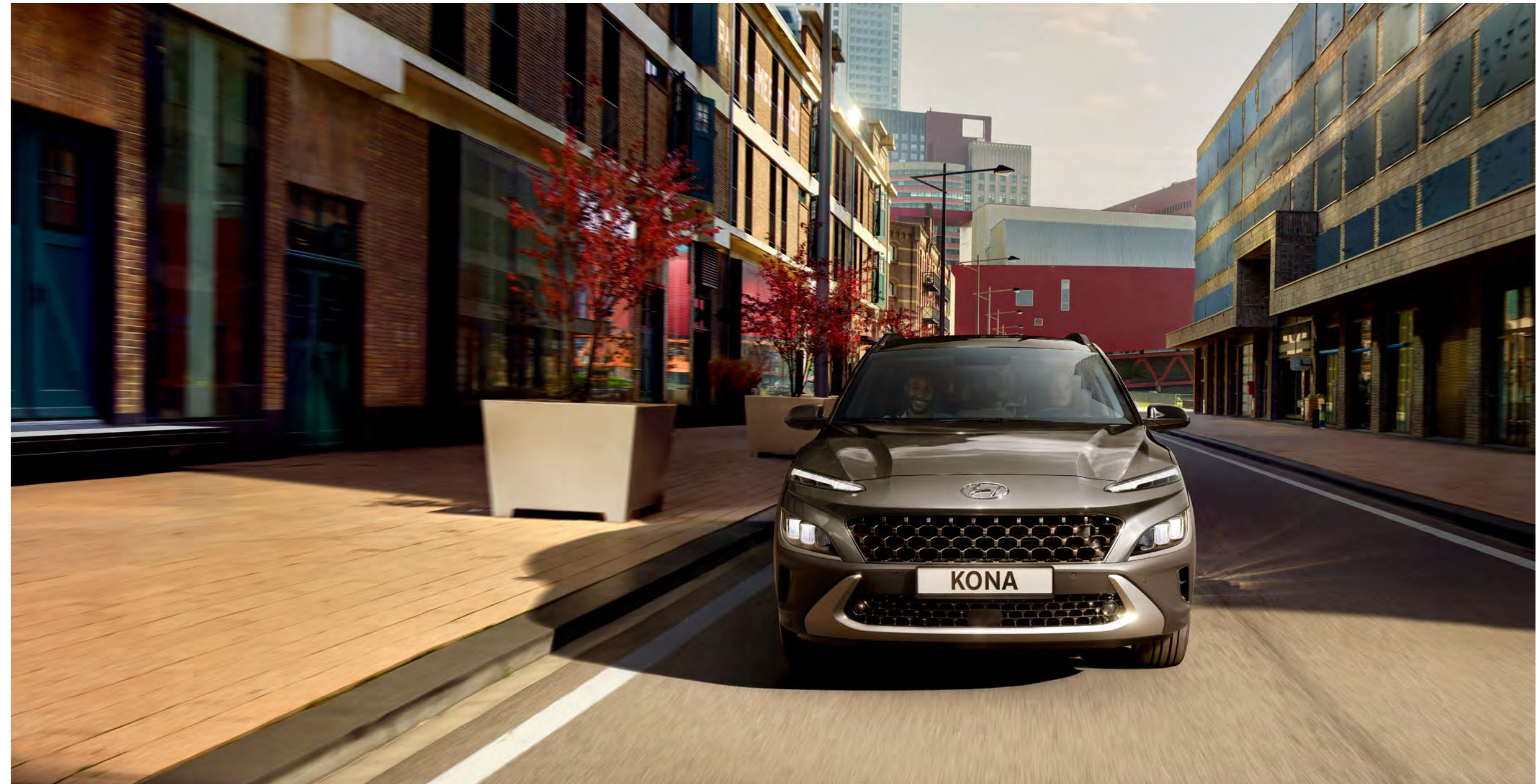
Car shown: KONA Hybrid Ultimate in Galactic Grey Metallic. Not to UK Specification. Colour choice may vary and is subject to availability.