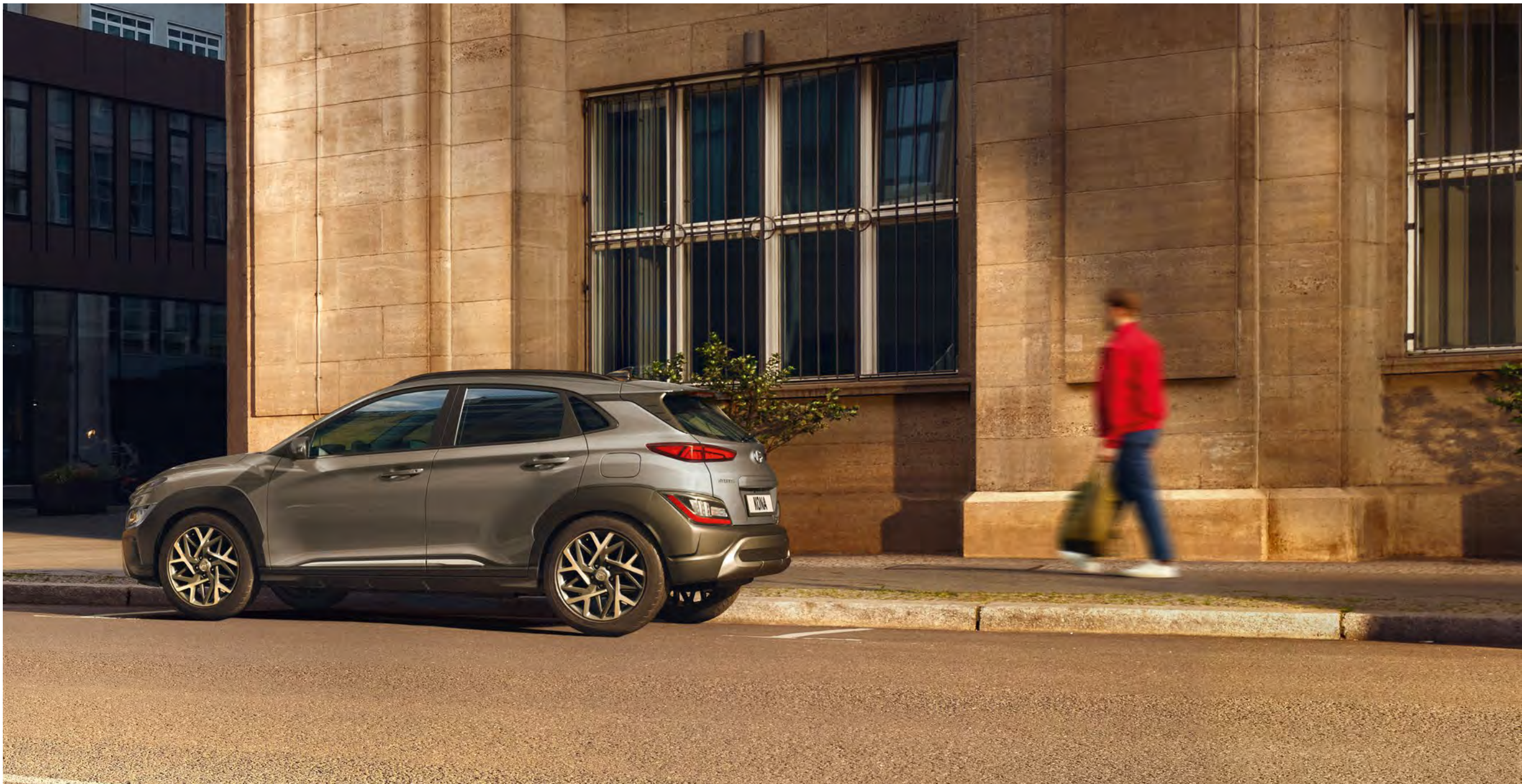
Car shown: KONA Hybrid Ultimate in Galactic Grey Metallic. Not to UK Specification. Colour choice may vary and is subject to availability.