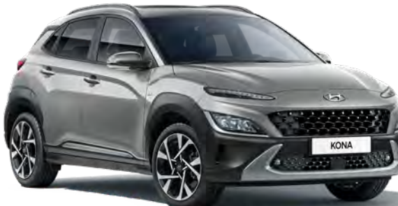
Cyber Grey Metallic*