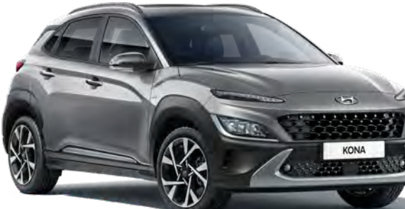
Galactic Grey Metallic*