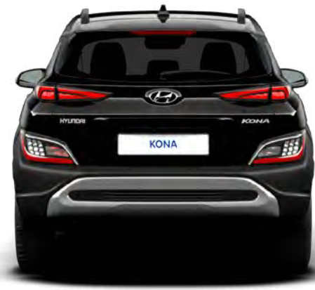
Car Shown: KONA Ultimate in Abyss Black Pearl. Not to UK specification.

Welcome to the KONA from Hyundai - with bold styling, advanced technology, and comprehensive connectivity. Enhanced fuel efficiency is delivered thanks to a choice of Hybrid and 48V Mild Hybrid engines.