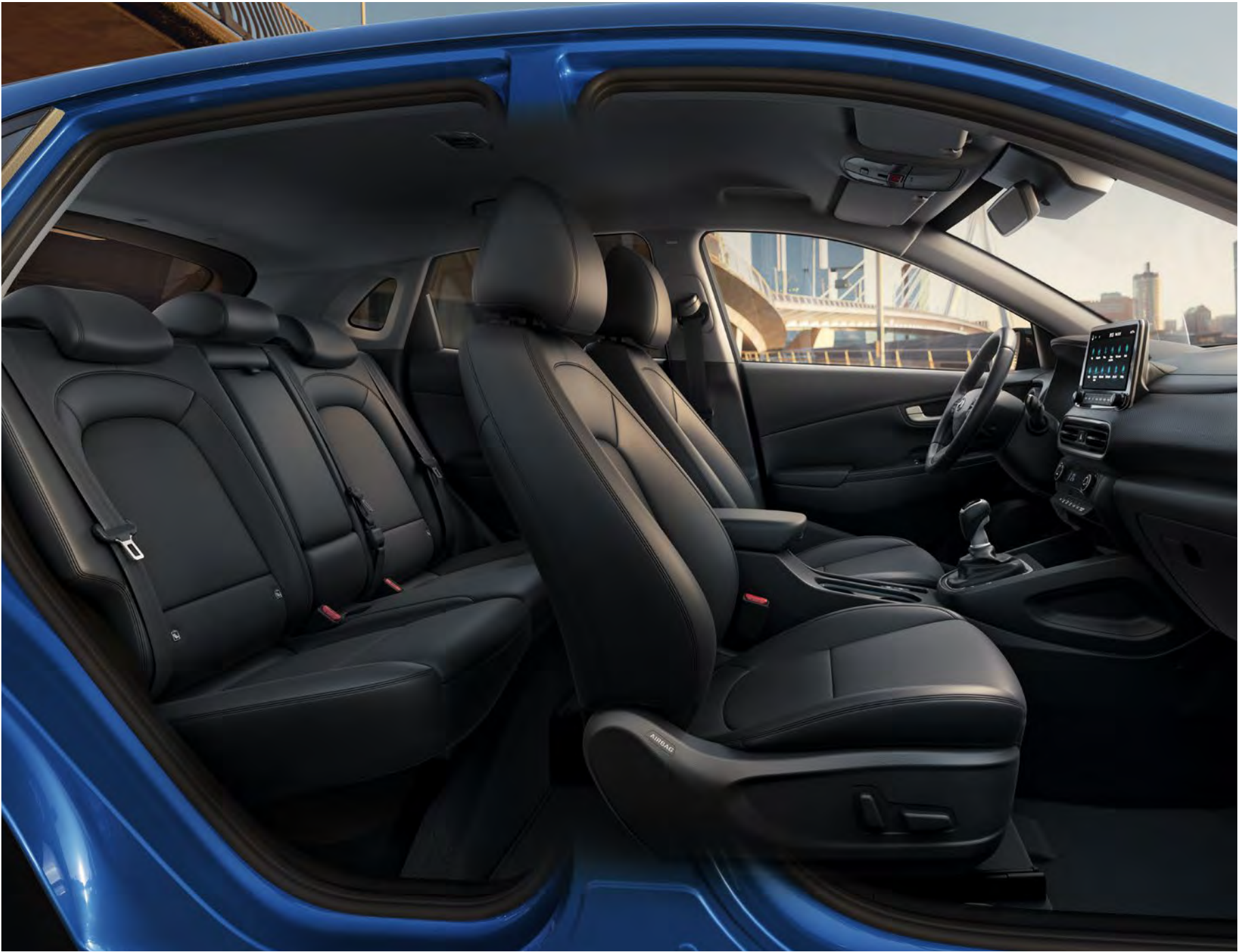
Car shown: KONA Hybrid Ultimate in Surfy Blue Metallic. Not to UK Specification. Colour choice may vary and is subject to availability.