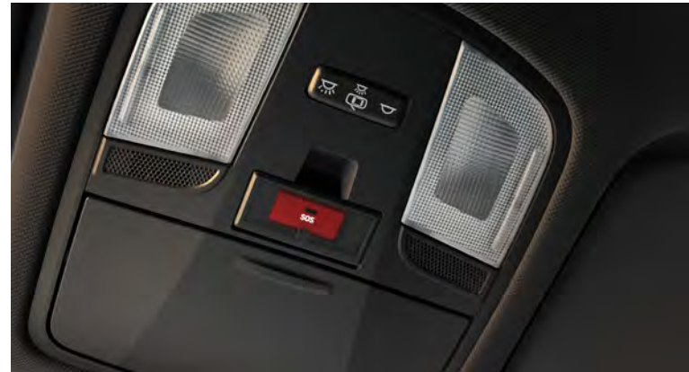
eCall standard across all trims.