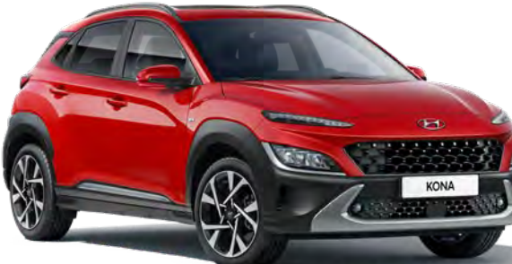
Ignite Red Solid*