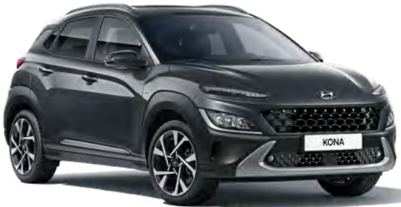
Ecotronic Grey Pearl*