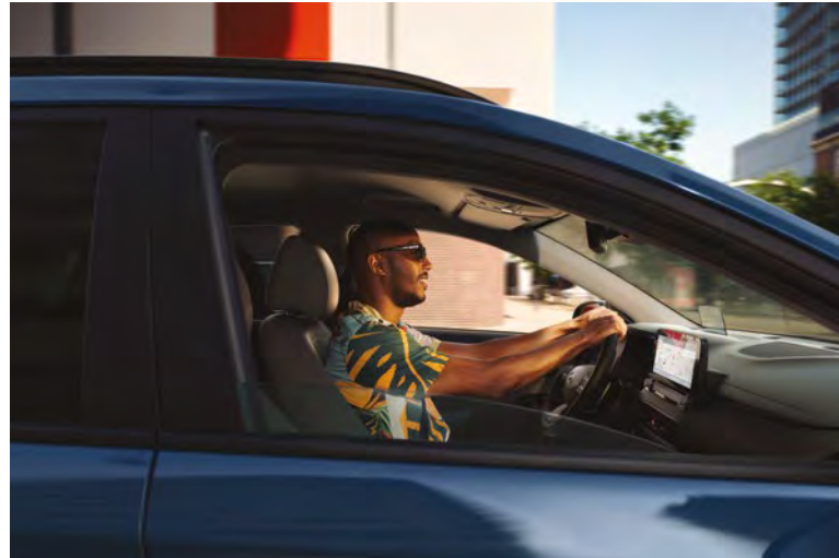
Car shown: KONA Hybrid Ultimate in Surf Blue Metallic. Not to UK Specification. Colour choice may vary and is subject to availability.

Packing a punch with the 1.6 GDi Hybrid engine, the KONA Hybrid delivers 141 PS of power via the flexible 6-speed Dual Clutch transmission.