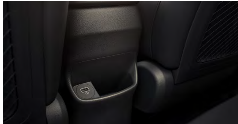
Rear USB charger standard on N Line, Premium and Ultimate trims.

The KONA seamlessly connects you to your lifestyle with advanced technology at your fingertips.