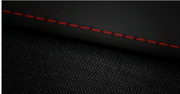
N Line Cloth – Red Stitching Standard on N Line trim.