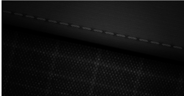
Black Cloth Standard on SE Connect and Premium trims.