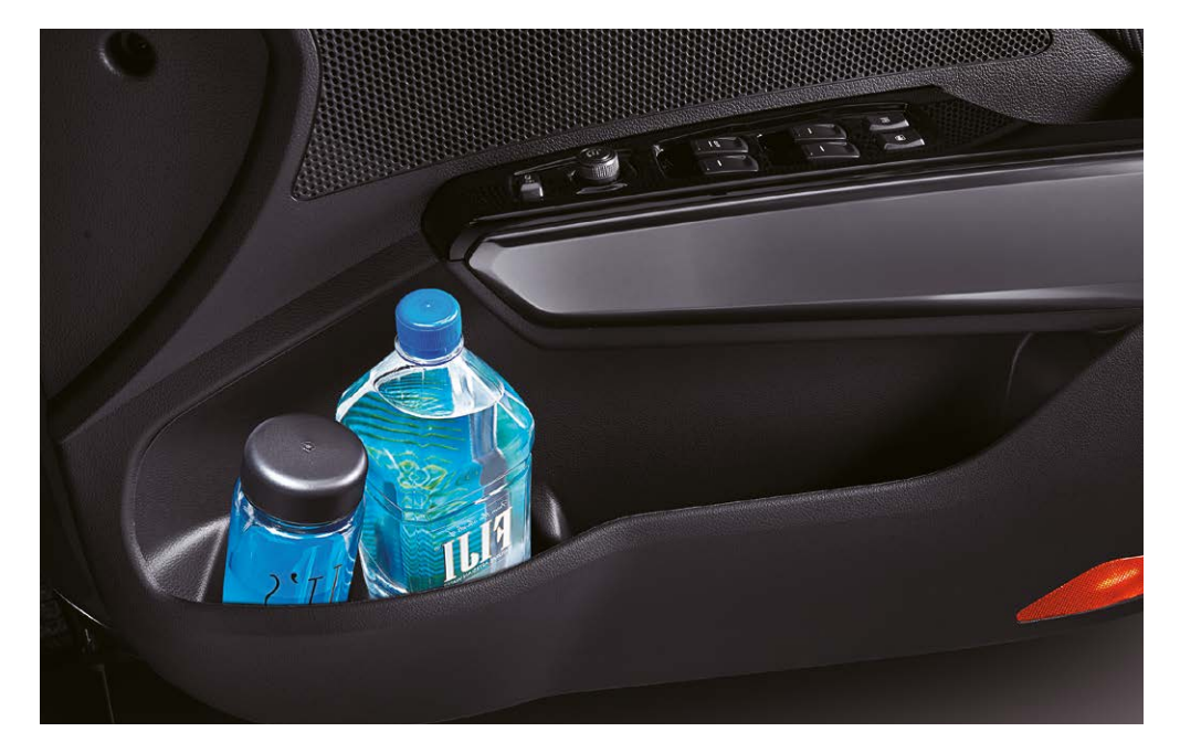
Large capacity door map pockets