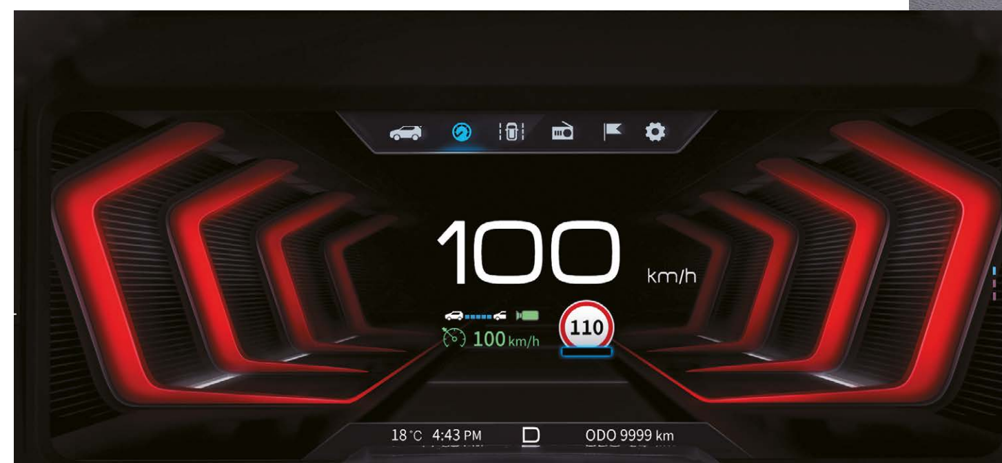
10.25" Digital cluster