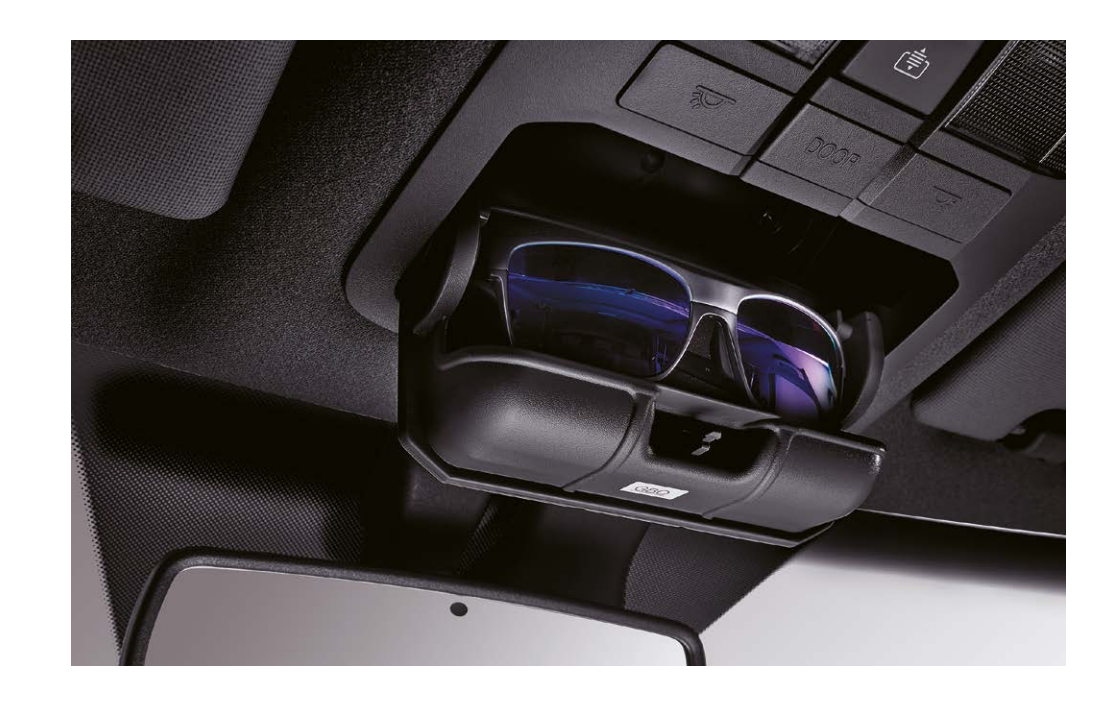
Overhead sunglasses storage

To be truly comfortable on any journey you need to know that there's the perfect space for everything you need. Our intelligent storage systems create space in the most ingenious places.