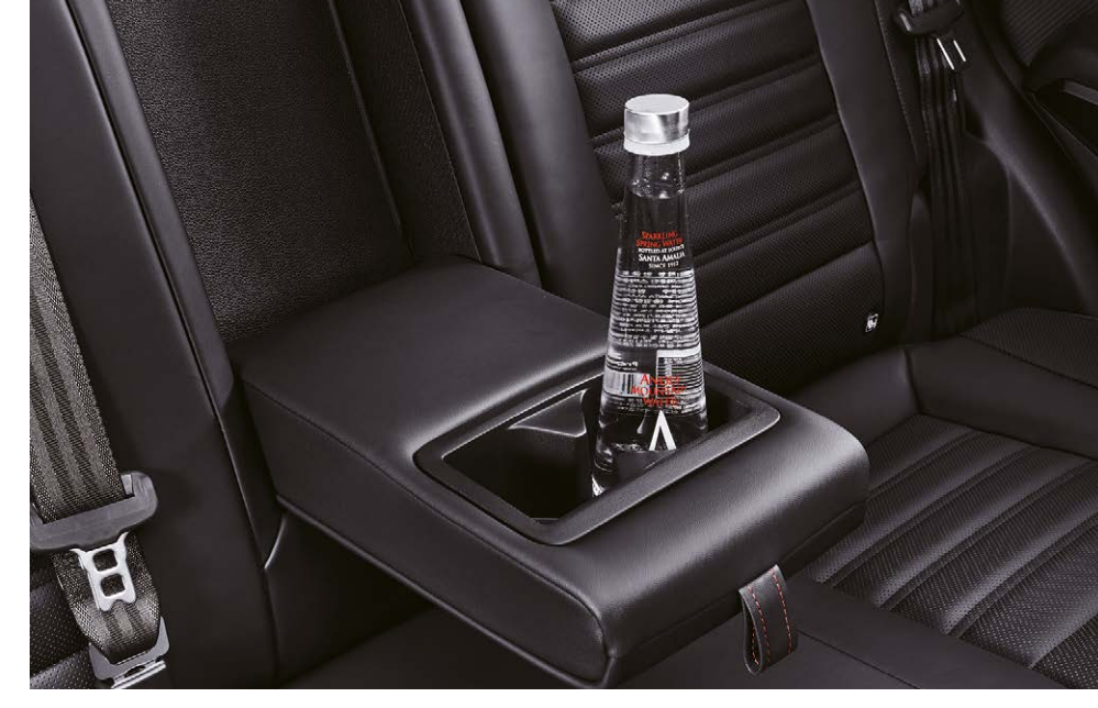
New centre armrest with storage