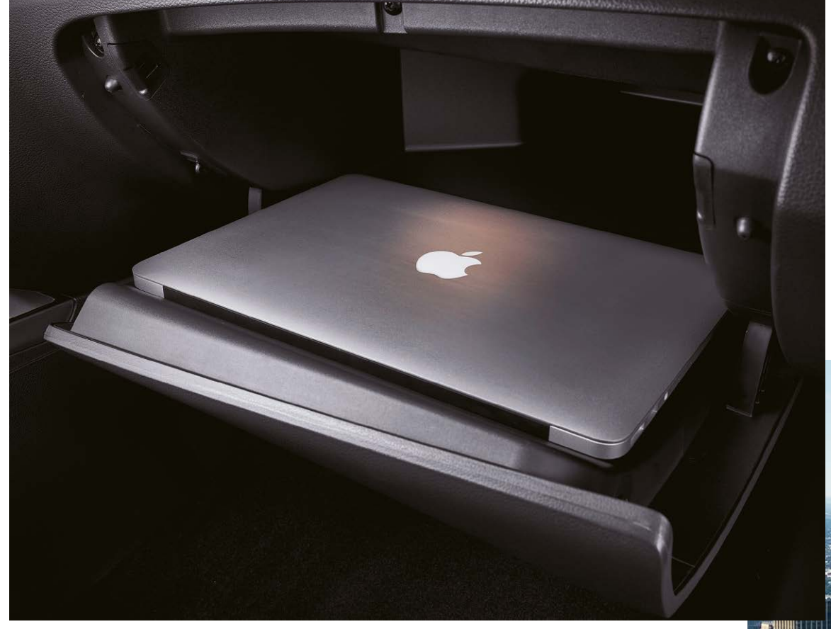
Spacious glove box