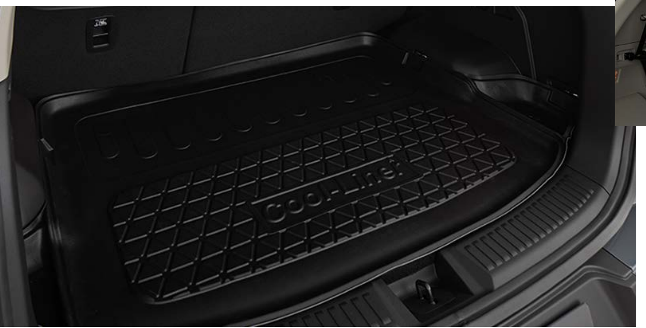
Plastic boot liner

We have a range of accessories for all of our models that will make it a little more "you". How about adding a tow bar for transporting your caravan or horse box, or adding roof bars to add a spacious roof box for even more storage? We even have varying ways of transporting your bikes on the outside of your car - that way you keep the mud there too!