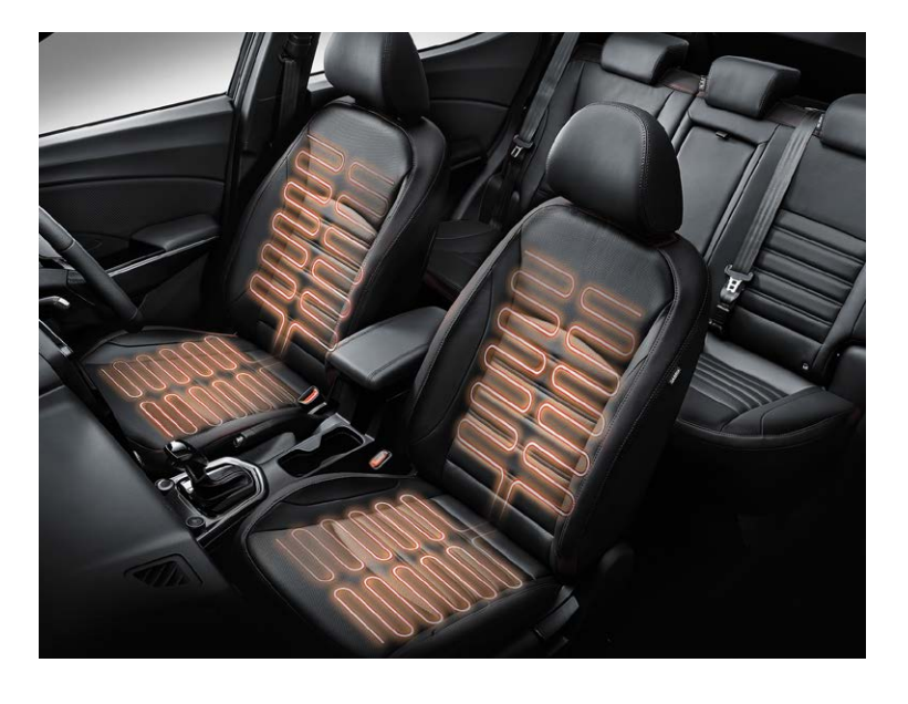
Heated front seats