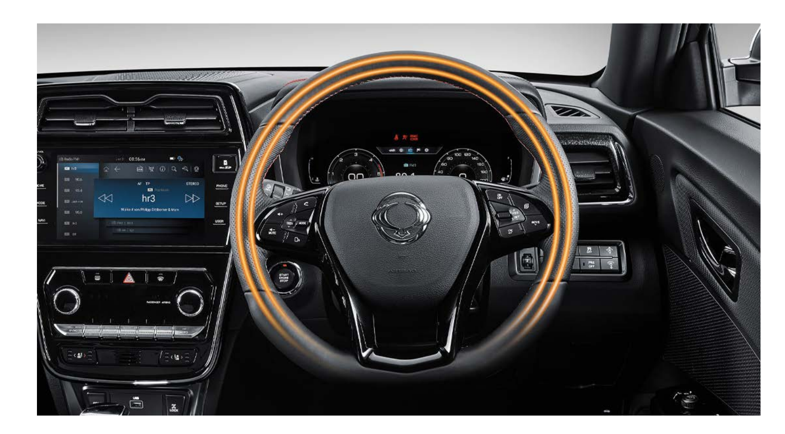
Heated steering wheel

The heated front seats are fashioned for relaxation and offer support where it's needed. Cocooned in a comfortable cabin, protected from the outside elements, Tivoli means staying fresh and alert on even the longest journey.