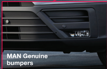
MAN Genuine bumpers