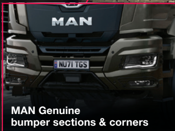
MAN Genuine bumper sections & corners