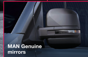
MAN Genuine mirrors