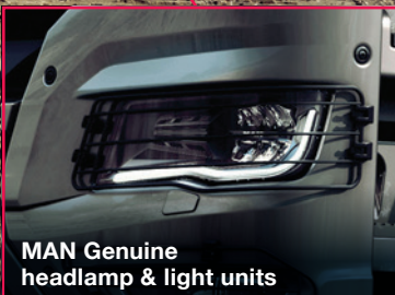
MAN Genuine headlamp & light units