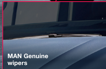
MAN Genuine wipers