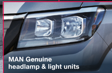
MAN Genuine headlamp & light units