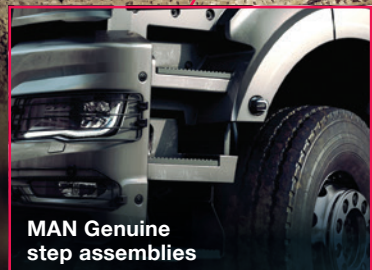
MAN Genuine step assemblies