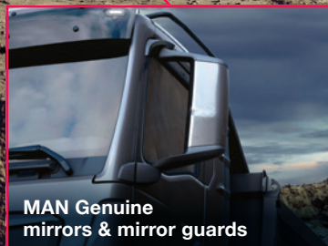
MAN Genuine mirrors & mirror guards

CONTACT YOUR LOCAL DEALER FOR MORE INFORMATION ON OUR LATEST 8X4 OFFERS.