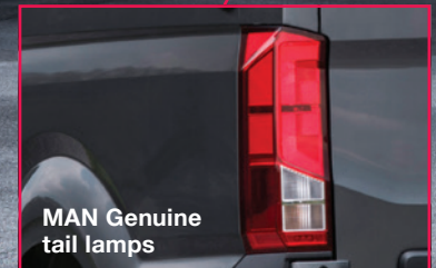
MAN Genuine tail lamps