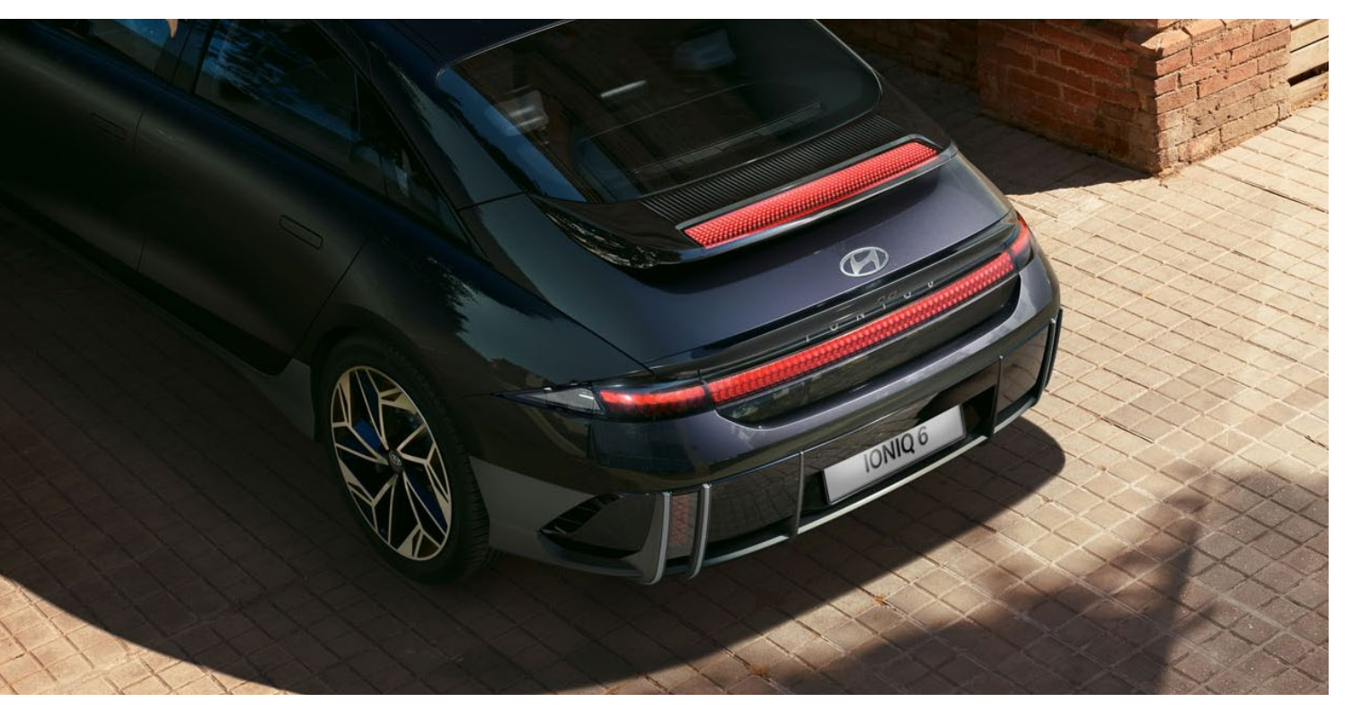
The wing-inspired rear spoiler features glass-like, transparent materials that highlight the unique Parametric Pixels lighting signature.

Designed for aerodynamic efficiency, IONIQ 6 can deliver up to 338 miles of estimated range, aided by its ultra-low drag coefficient of 0.21 and cutting-edge electric drive system.