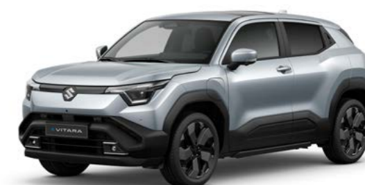
SPLENDID SILVER PEARL METALLIC