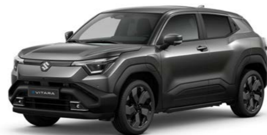
GRANDEUR GREY PEARL METALLIC