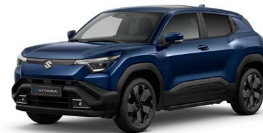
CELESTIAL BLUE PEARL METALLIC