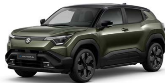
LAND BREEZE GREEN PEARL METALLIC