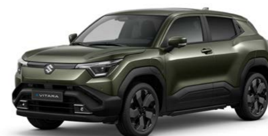
LAND BREEZE GREEN PEARL METALLIC