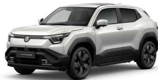
ARCTIC WHITE PEARL