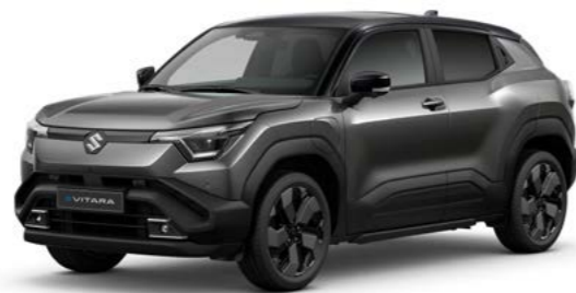
GRANDEUR GREY PEARL METALLIC