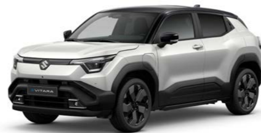
ARCTIC WHITE PEARL