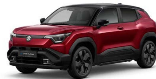
OPULENT RED PEARL METALLIC