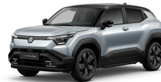
SPLENDID SILVER PEARL METALLIC