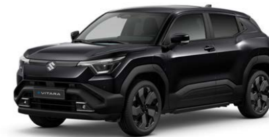
BLUISH BLACK PEARL