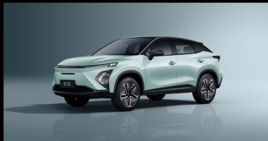
Obsidian Black roof with Jade Green body