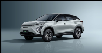
Obsidian Black roof with Galena Silver body