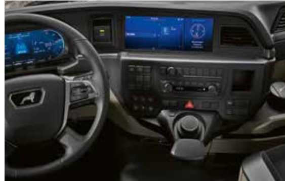
Infotainment system with 12-inch display and MAN SmartSelect

The infotainment system can be operated either via a classic control system with buttons or via MAN SmartSelect (can be combined from version Advanced 7-inch). Throughout, familiar usage meets innovative comfort. The result is one you can see and feel, too, as high-quality surfaces make every journey with the new MAN TGS tangibly special.