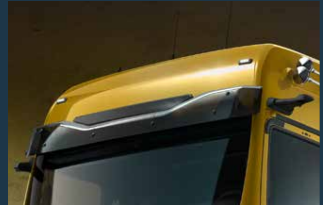
Aerodynamically optimised sun visor

The new design sun visor in dark grey adds a touch of class to the front of the GX and GM cabs. It prevents the driver from being dazzled when the sun is at a steep angle. The new design has been optimised for aerodynamics, resulting in better airflow around the A-pillar at the roof and preventing separation of the air stream which is unfavourable for fuel consumption. This improvement of the drag coefficient (cd value) reduces fuel consumption.