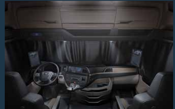
Spacious overhead lockers with a tambour door in the middle

The GX cab, for instance, boasts more than 1,100 litres of stowage space, ensuring that you can neatly fit in everything you need – even for several days on the road.