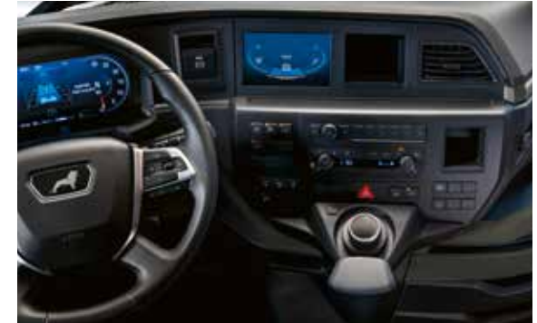
Infotainment system with 7-inch display and MAN SmartSelect