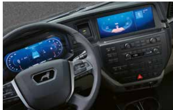
Infotainment system with 12-inch display and control system below the secondary display