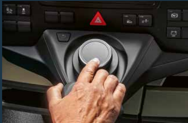
Innovative MAN SmartSelect multimedia controls

And a host of clever storage areas and compartments make great use of the additional room. The overhead lockers above the windscreen, multifunctional compartments and secure, pull-out drawers in the centre part of the instrument panel are particularly practical in a driver's day-to-day. Depending on the cab option, various storage boxes, compartments and an in-set or pull-out fridge are also available.