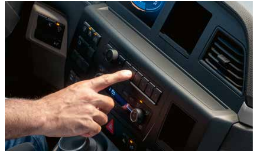
Freely programmable direct access buttons fitted with touch sensors

Theory times experience: the controls for the MAN TGX are the result of combining the latest scientific analyses with insights from intensive on-road tests with drivers.