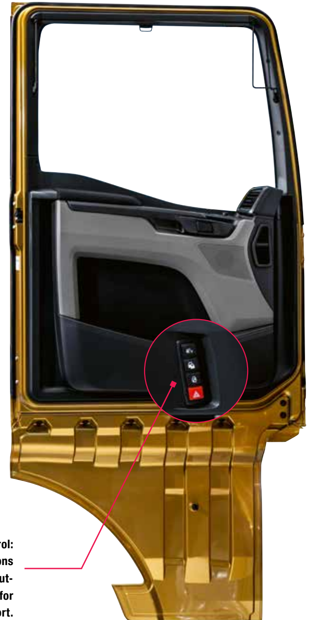
MAN EasyControl: four control buttons reachable from outside the vehicle for maximum comfort.

Even the steering wheel has been given greater flexibility: for the resting position, the steering wheel can be tilted forward to a horizontal position by the driver, and in action as well, it can be given as steep an angle as that of an average passenger car. The result is a workplace that bends over not only backwards, but forwards and sideways as well, to suit. So the driver doesn't have to.