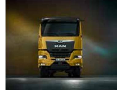
CAB GX: THE MAXIMUM ONE (wide, long, extra height)