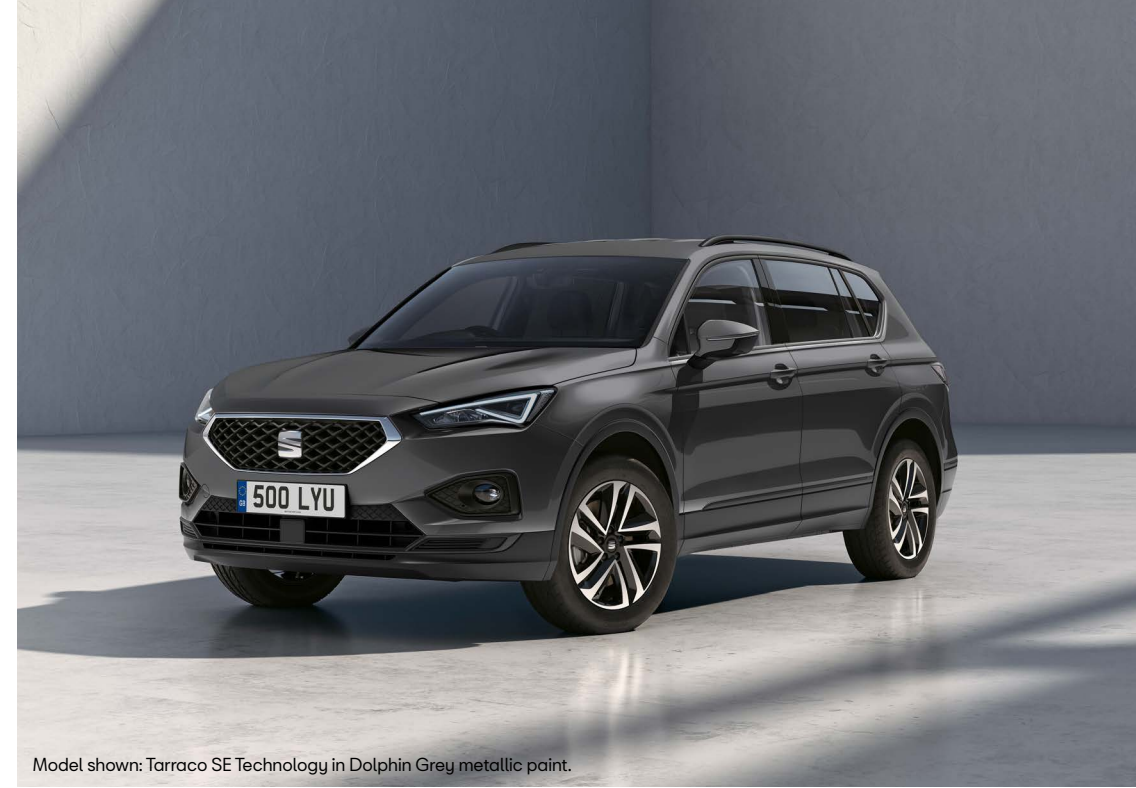
Model shown: Tarraco SE Technology in Dolphin Grey metallic paint.