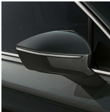
Dark Camouflage 2