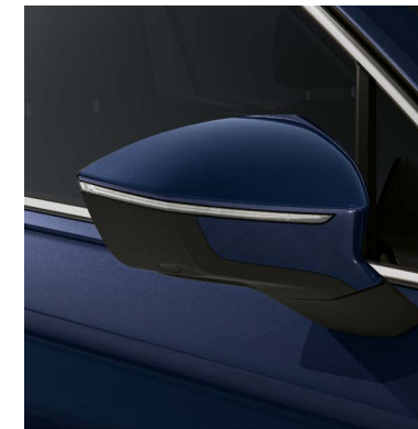
Atlantic Blue 2