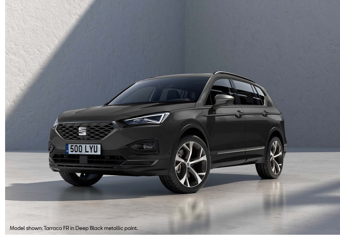
Model shown: Tarraco FR in Deep Black metallic paint.