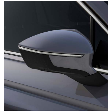
Dolphin Grey 2