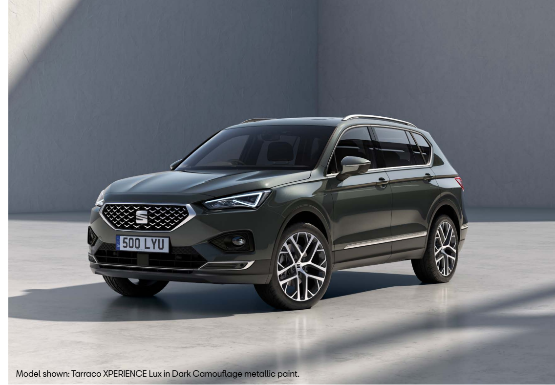
Model shown: Tarraco XPERIENCE Lux in Dark Camouflage metallic paint.