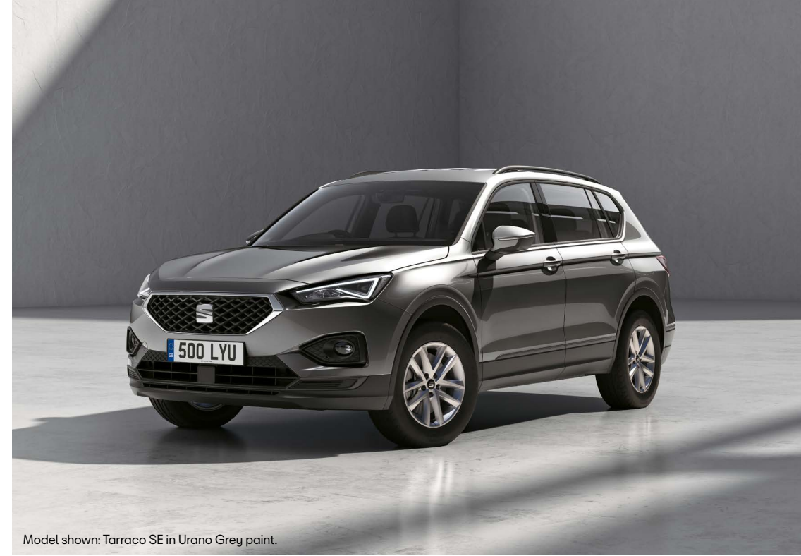
Model shown: Tarraco SE in Urano Grey paint.