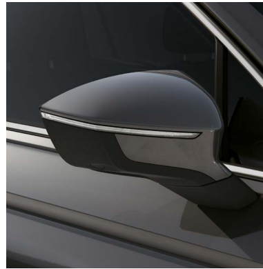
Urano Grey 1