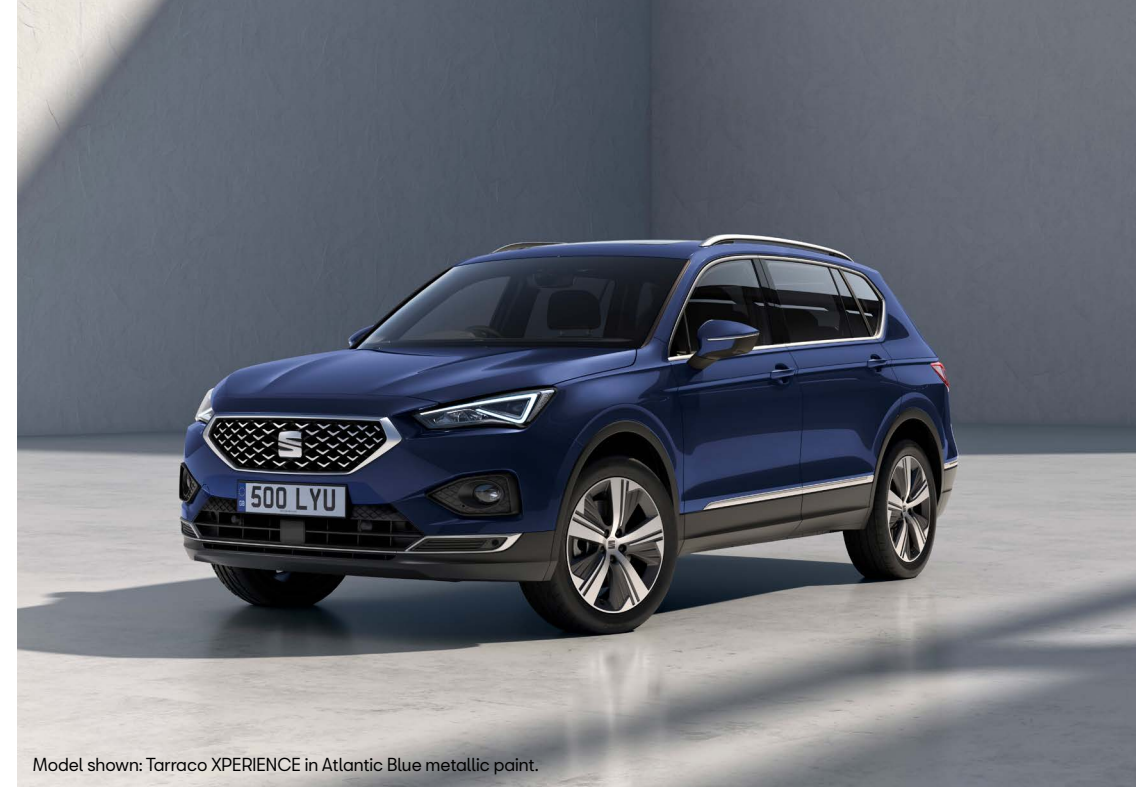
Model shown: Tarraco XPERIENCE in Atlantic Blue metallic paint.