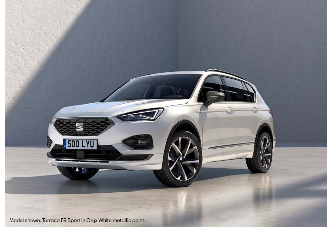
Model shown: Tarraco FR Sport in Oryx White metallic paint.