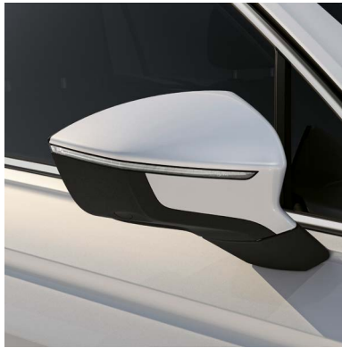
Oryx White 2

Print and screen view do not provide an exact representation of colour. Please refer to the paint colour moulds at your local SEAT Retailer.