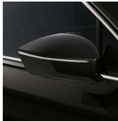
Deep Black 2