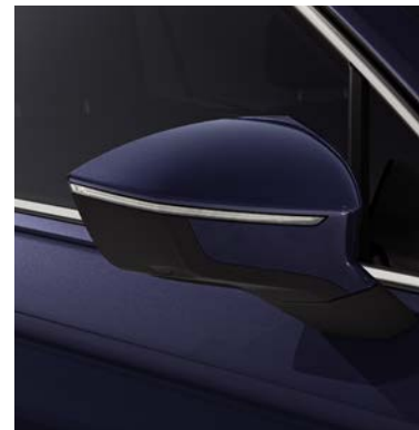
Atlantic Blue 2