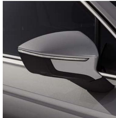
Reflex Silver 2