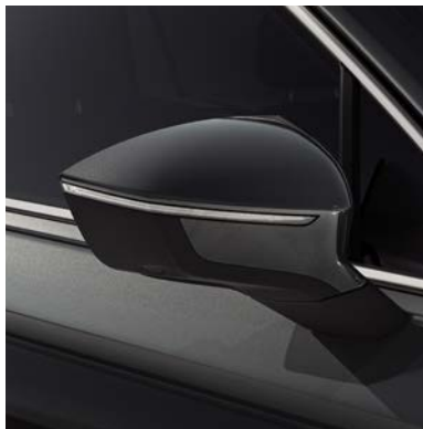
Dark Camouflage 2