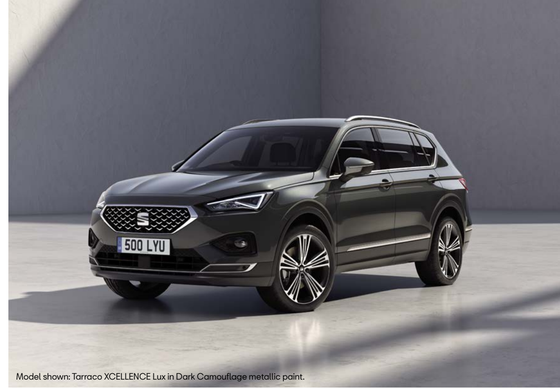
Model shown: Tarraco XCELLENCE Lux in Dark Camouflage metallic paint.