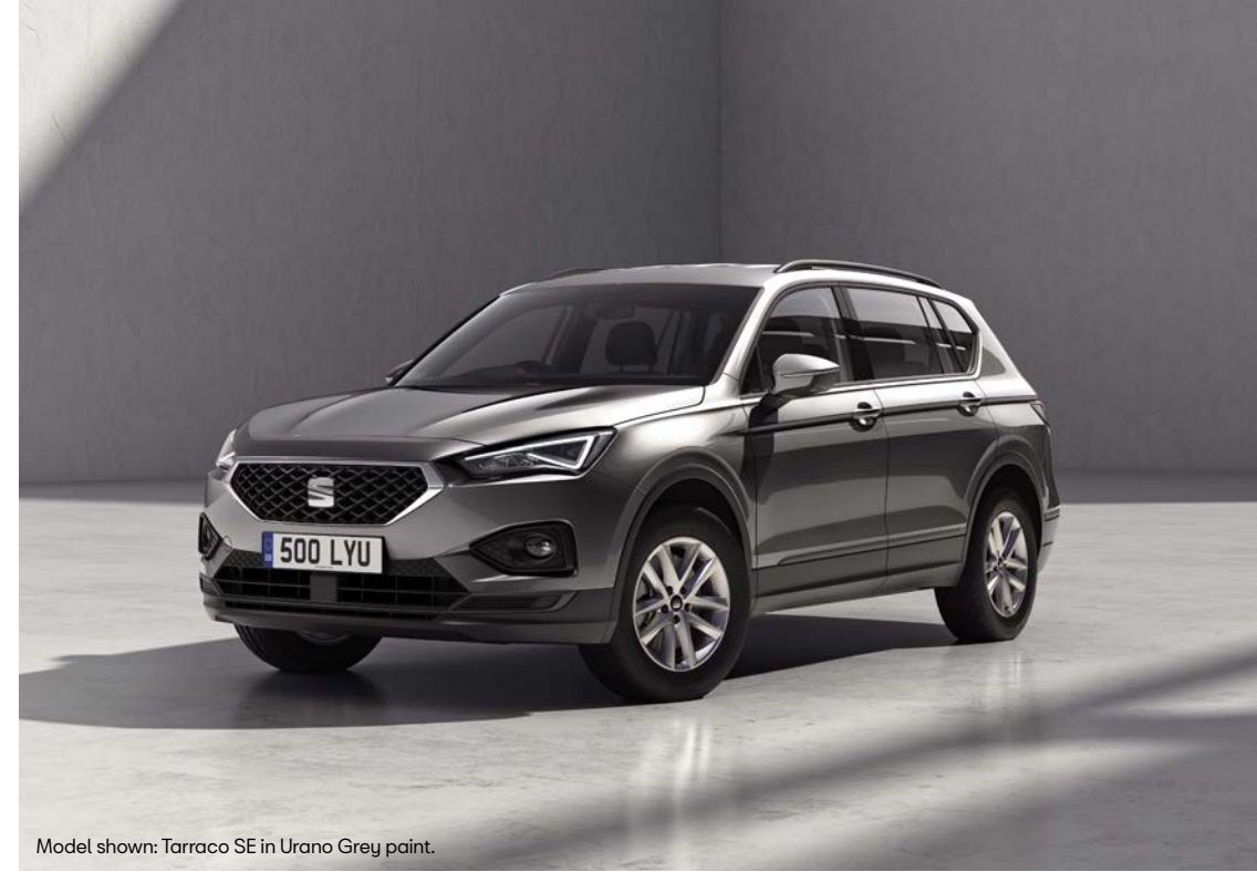
Model shown: Tarraco SE in Urano Grey paint.