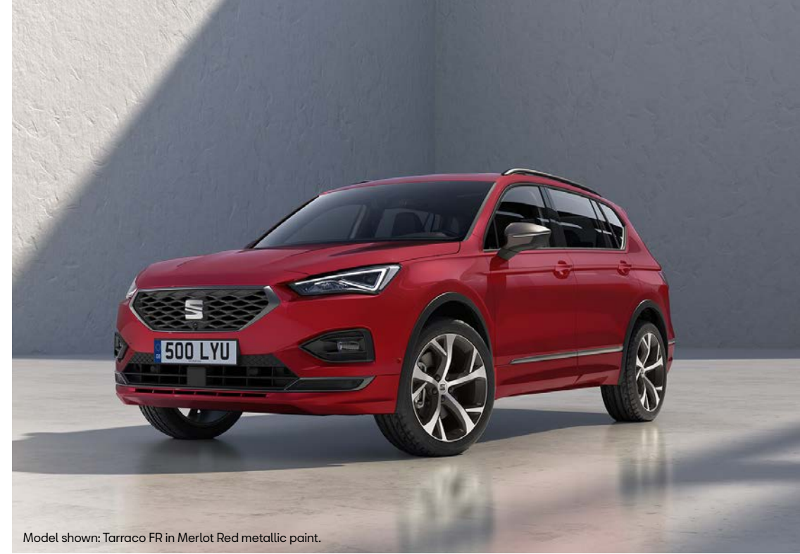
Model shown: Tarraco FR in Merlot Red metallic paint.

*Price is for Tarraco FR 1.5 TSI EVO 150PS.