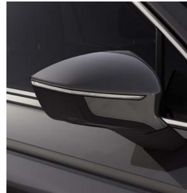
Urano Grey 1