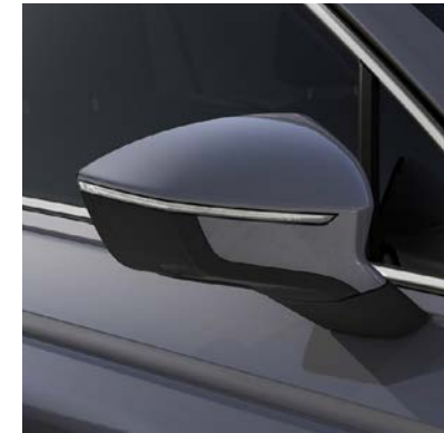
Dolphin Grey 2