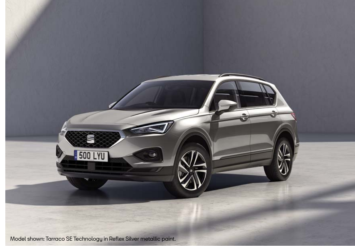
Model shown: Tarraco SE Technology in Reflex Silver metallic paint.

The SEAT Connect services can be operated only by using available public communication technologies. Please note that due to development of these technologies, especially mobile networks, SEAT cannot guarantee consistent availability in all countries for the duration of SEAT Connect services. Possible changes in technology may cause permanent unavailability of them.