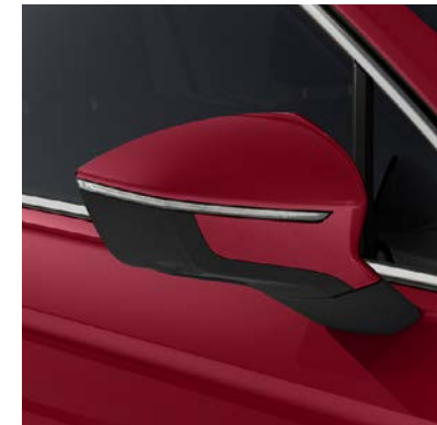
Merlot Red 2