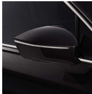
Deep Black 2