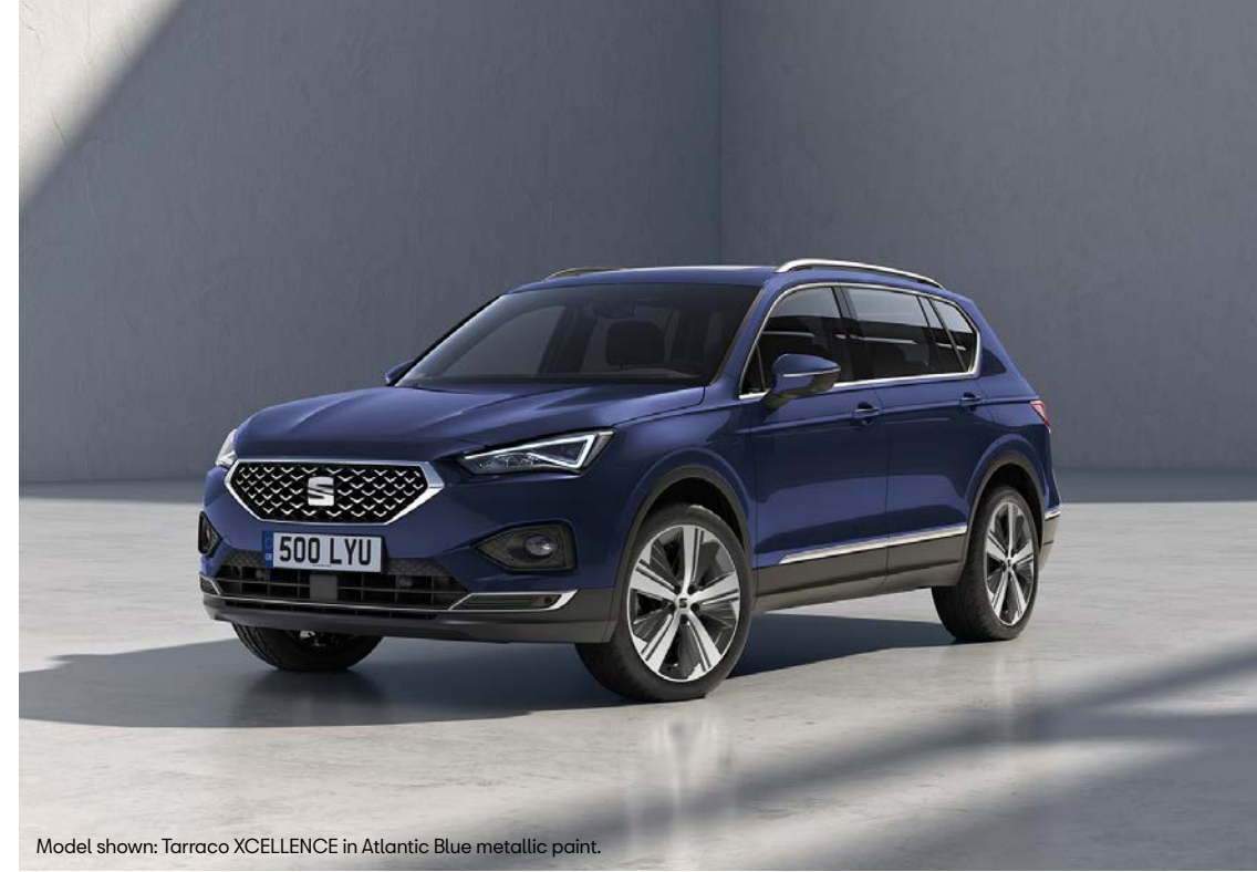
Model shown: Tarraco XCELLENCE in Atlantic Blue metallic paint.

02. Baza Grey cloth with brown Alcantara.