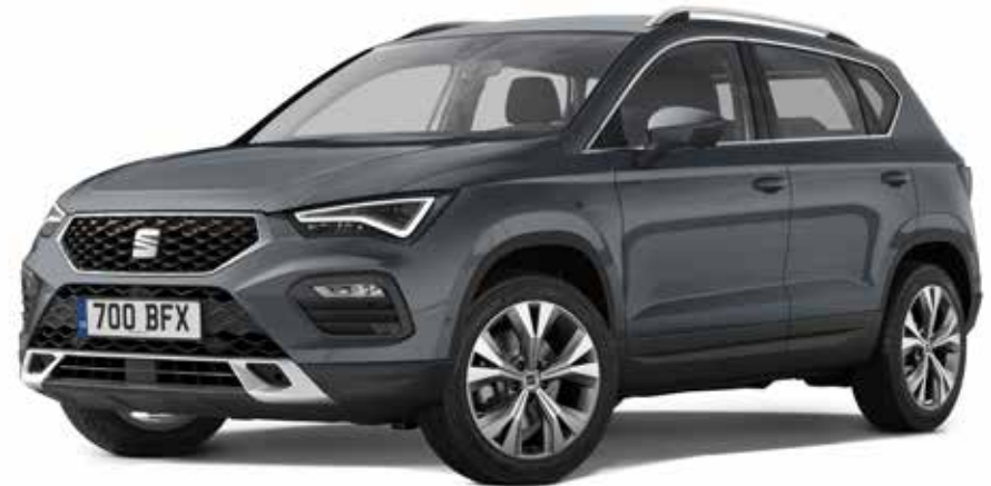
Model shown: Ateca SE Technology in Rhodium Grey metallic paint.