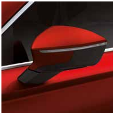
Velvet Red 2