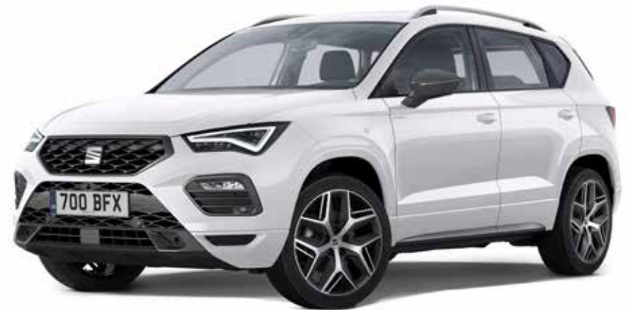
Model shown: Ateca FR Sport in Nevada White metallic paint.