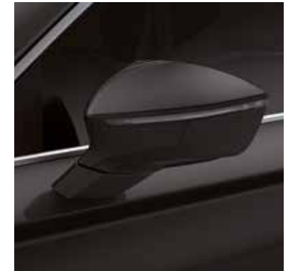
Black Magic 2