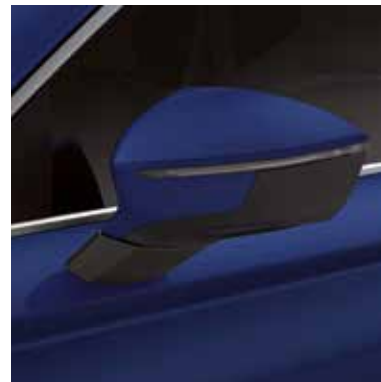
Energy Blue 1