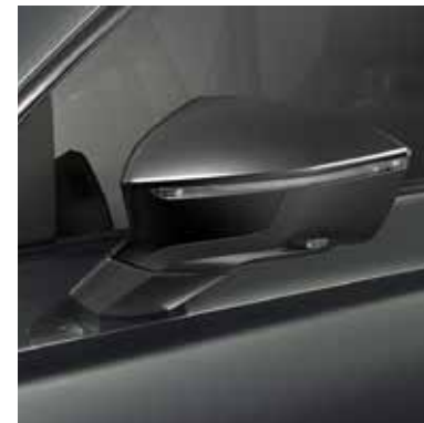
Dark Camouflage 2