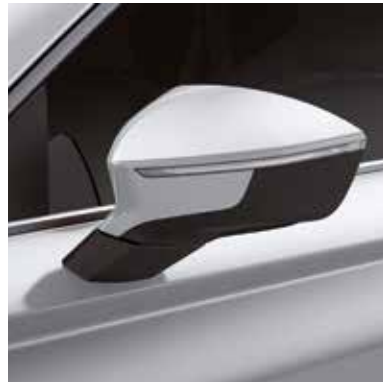
Nevada White 2