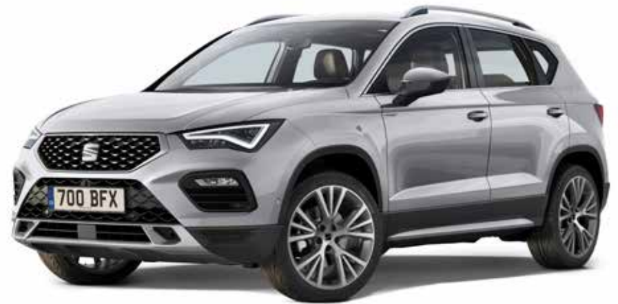
Model shown: Ateca XPERIENCE Lux in Reflex Silver metallic paint.