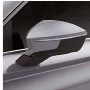
Reflex Silver 2