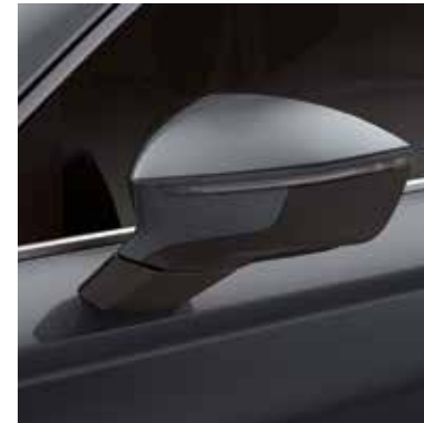
Rhodium Grey 2