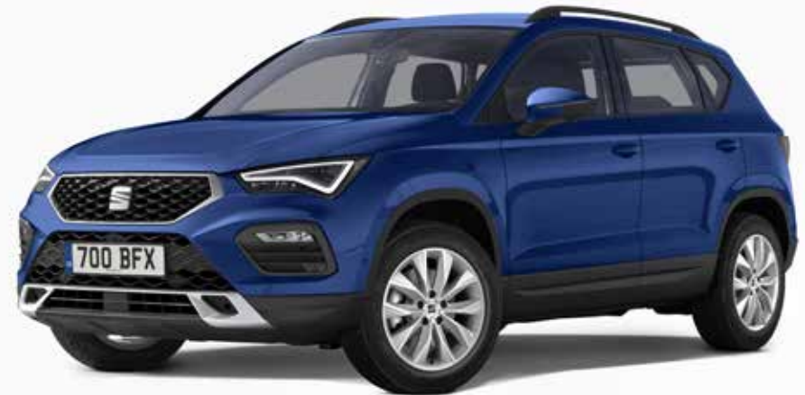
Model shown: Ateca SE in Energy Blue metallic paint.

5 The SEAT Ateca. Pricing and specification list.