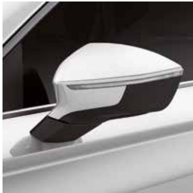
Bila White 1

Print and screen view do not provide an exact representation of colour. Please refer to the paint colour moulds at your local SEAT Retailer.