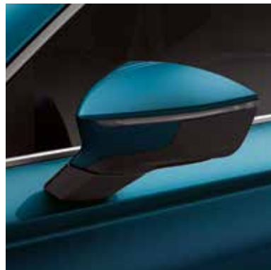
Lava Blue 2