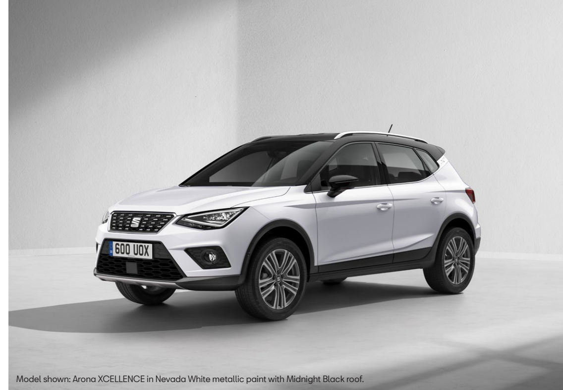
Model shown: Arona XCELLENCE in Nevada White metallic paint with Midnight Black roof.

02. Titan Black cloth with contrast stitching.