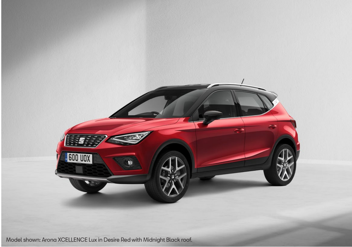
Model shown: Arona XCELLENCE Lux in Desire Red with Midnight Black roof.

10 The SEAT Arona. Pricing and specification list.