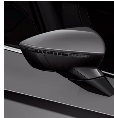
Magnetic Grey 2