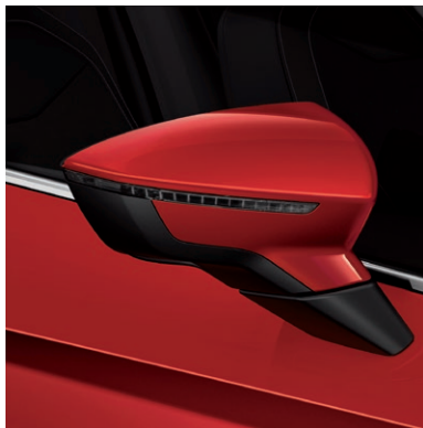
Desire Red 2