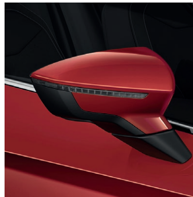
Emocion Red 1