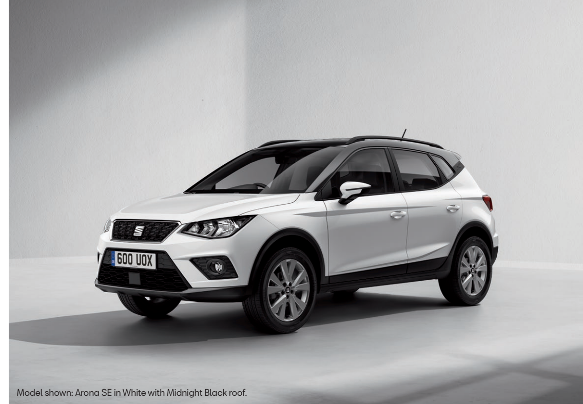
Model shown: Arona SE in White with Midnight Black roof.