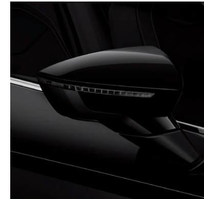
Midnight Black 2