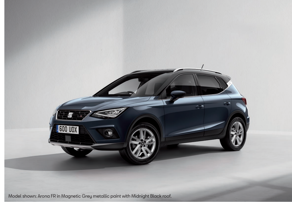
Model shown: Arona FR in Magnetic Grey metallic paint with Midnight Black roof.