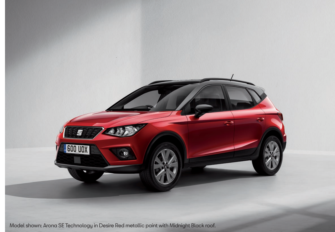
Model shown: Arona SE Technology in Desire Red metallic paint with Midnight Black roof.