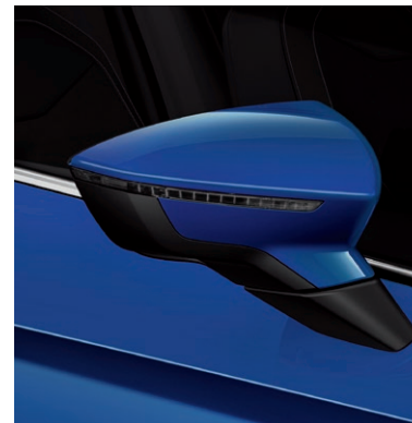
Mystery Blue 2