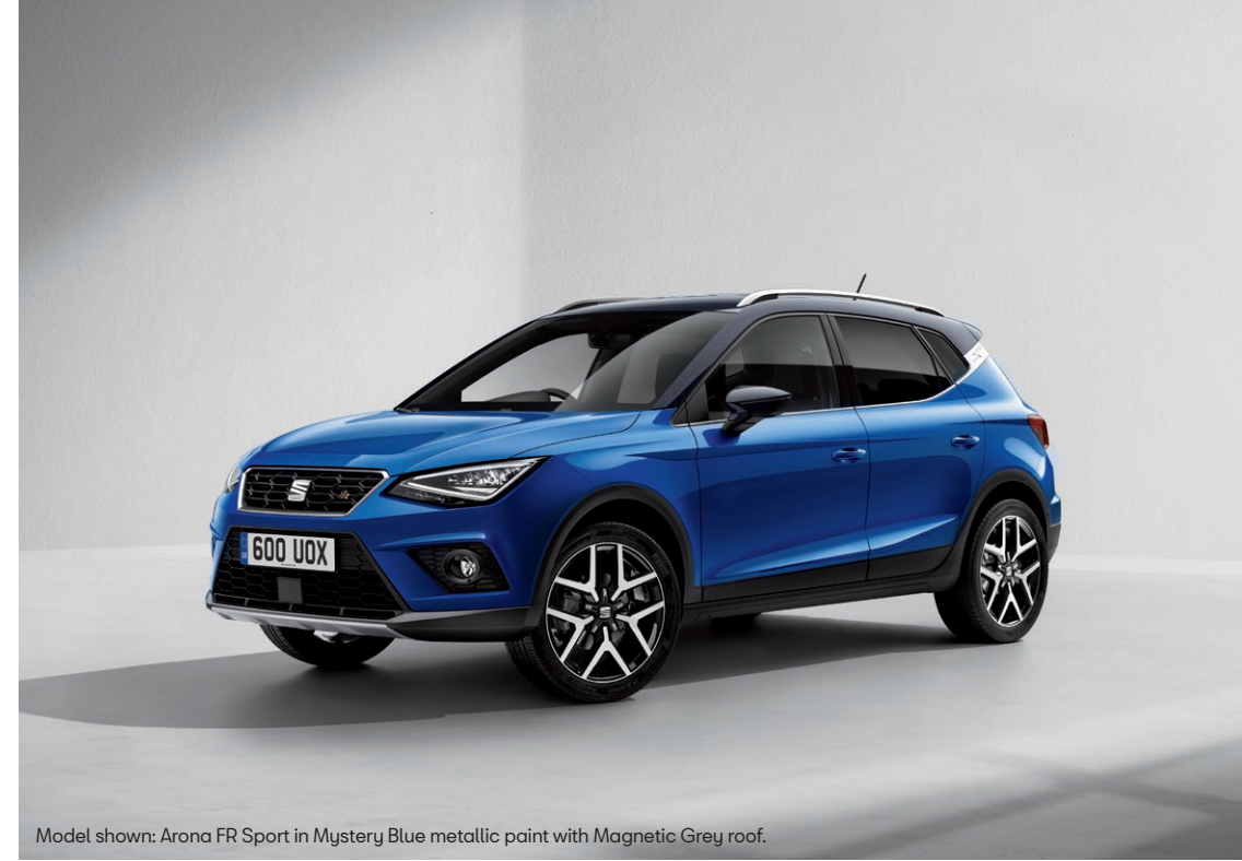
Model shown: Arona FR Sport in Mystery Blue metallic paint with Magnetic Grey roof.