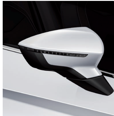
Nevada White 2