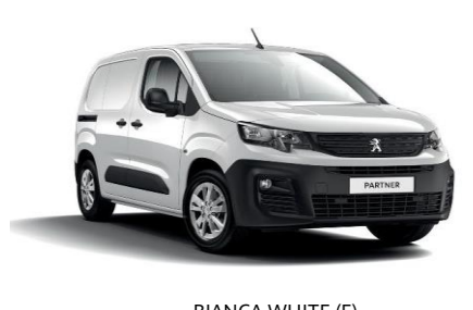
BIANCA WHITE (F)