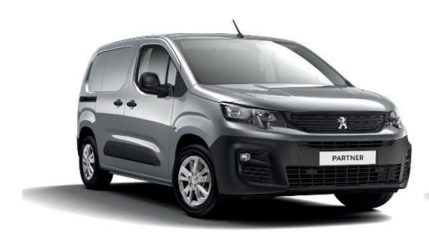
CUMULUS GREY (M)