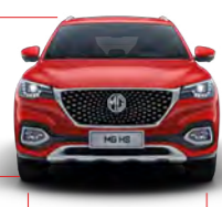
Height - including roof rails 1664mm Front track 1573mm Width - including mirrors 2078mm