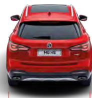
Height - including roof rails 1664mm Rear track 1584mm Width - excluding mirrors 1876mm