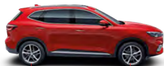
Wheelbase 2720mm Length 4574mm