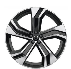
22" 5 Double Spoke (#1096)