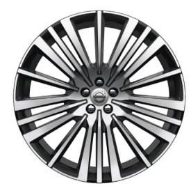
22" 20 Spoke (#800147)