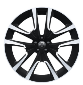
22" 5 Double Spoke (#800143)