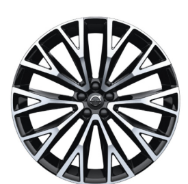
22" 10 Open Spoke (#800142)