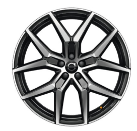
21" 5 Y Spoke (std Polestar Engineered)