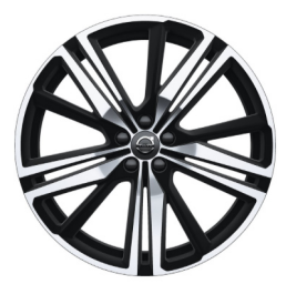
21" 5 Triple Spoke (#1013)