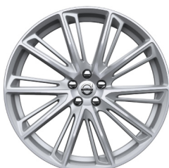
21" 10 Open Spoke Turbine (#800131)