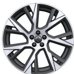
21" 7 Open Spoke (#800133)