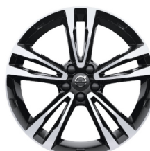
19" 5 Double Spoke (#224)