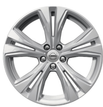
18" 5 Double Spoke (#1143)