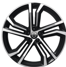
20" 5 Double Spoke (#1137)