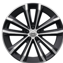
19" 5 Double Spoke (#1166)