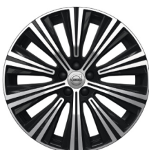
19" 10 Spoke (std. Inscription)