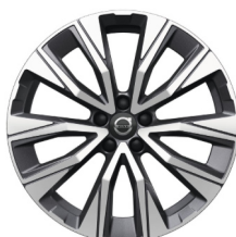
19" 6 Double Spoke (std. Cross Country)