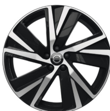
19" 5 Spoke (std. R-Design)