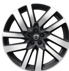
20" 5 V Spoke (#1167)