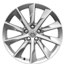
18" 10 Spoke Turbine (std. Momentum)