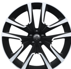
20" 5 Double Spoke (#800132)