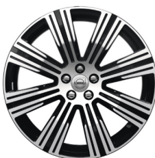
20" 8 Multi Spoke (#1139)