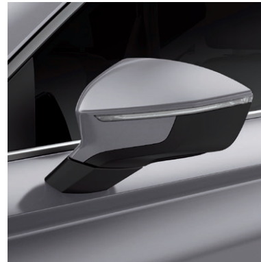
Reflex Silver 2