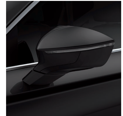
Black Magic 2