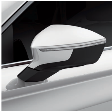
Bila White 1

Print and screen view do not provide an exact representation of colour. Please refer to the paint colour moulds at your local SEAT Retailer.