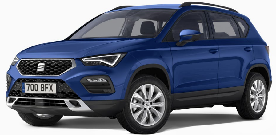
Model shown: Ateca SE in Energy Blue metallic paint.