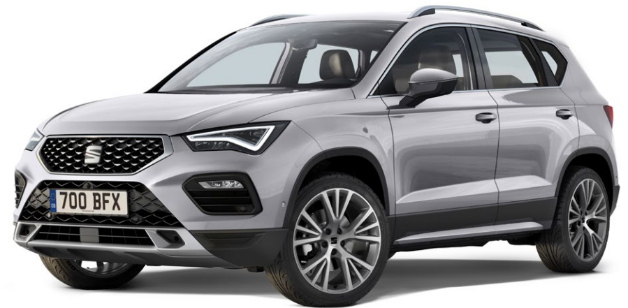
Model shown: Ateca XPERIENCE Lux in Reflex Silver metallic paint.