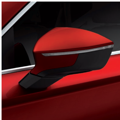
Velvet Red 2