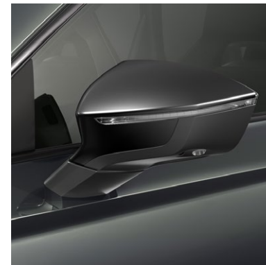
Dark Camouflage 2