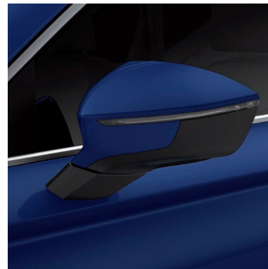
Energy Blue 1