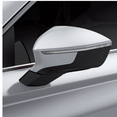
Nevada White 2