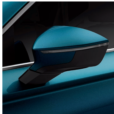
Lava Blue 2