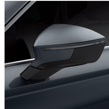
Rhodium Grey 2