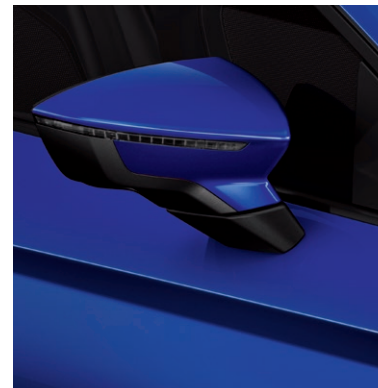
Mystery Blue 2