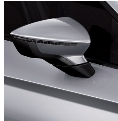
Urban Silver 2