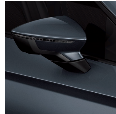
Magnetic Grey 2