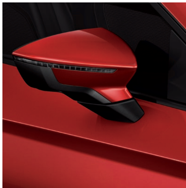
Desire Red 2