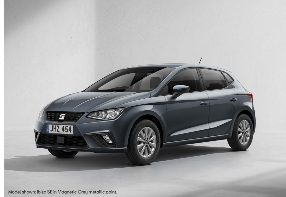
Model shown: Ibiza SE in Magnetic Grey metallic paint.