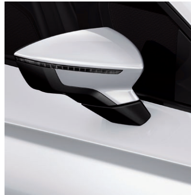
Nevada White 2