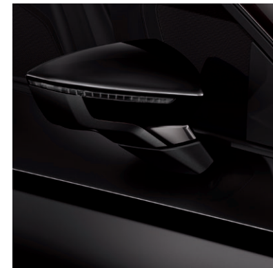
Midnight Black 2