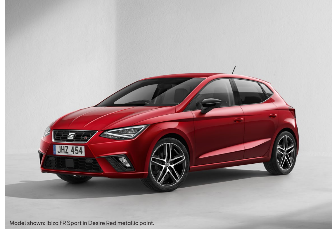
Model shown: Ibiza FR Sport in Desire Red metallic paint.

*Price is for Ibiza FR Sport 1.0 MPI 80PS.