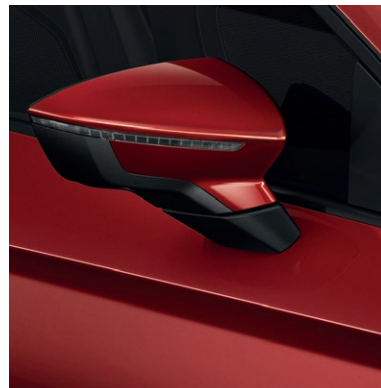
Emocion Red 1