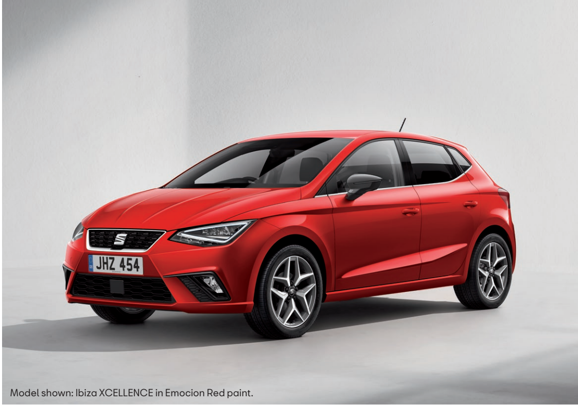
Model shown: Ibiza XCELLENCE in Emocion Red paint.

*Price is for Ibiza XCELLENCE 1.0 TSI 95PS.