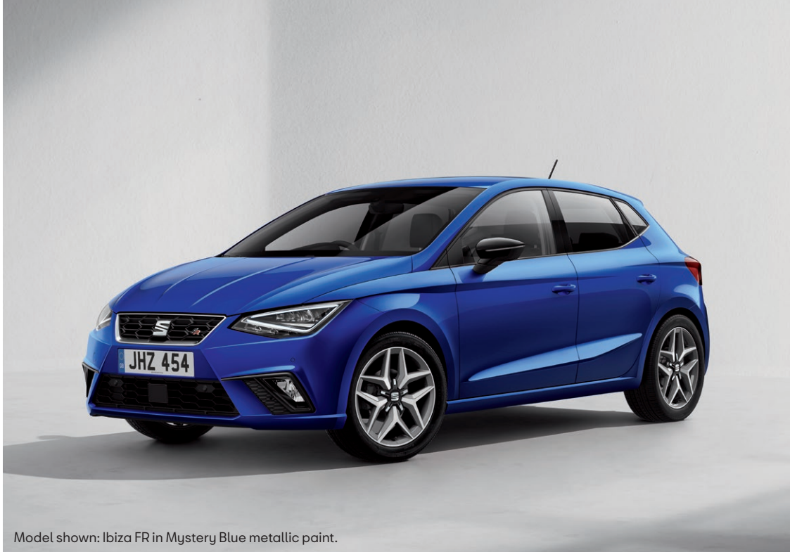
Model shown: Ibiza FR in Mystery Blue metallic paint.

The SEAT Connect services can be operated only by using available public communication technologies. Please note that due to development of these technologies, especially mobile networks, SEAT cannot guarantee consistent availability in all countries for the duration of SEAT Connect services. Possible changes in technology may cause permanent unavailability of them.