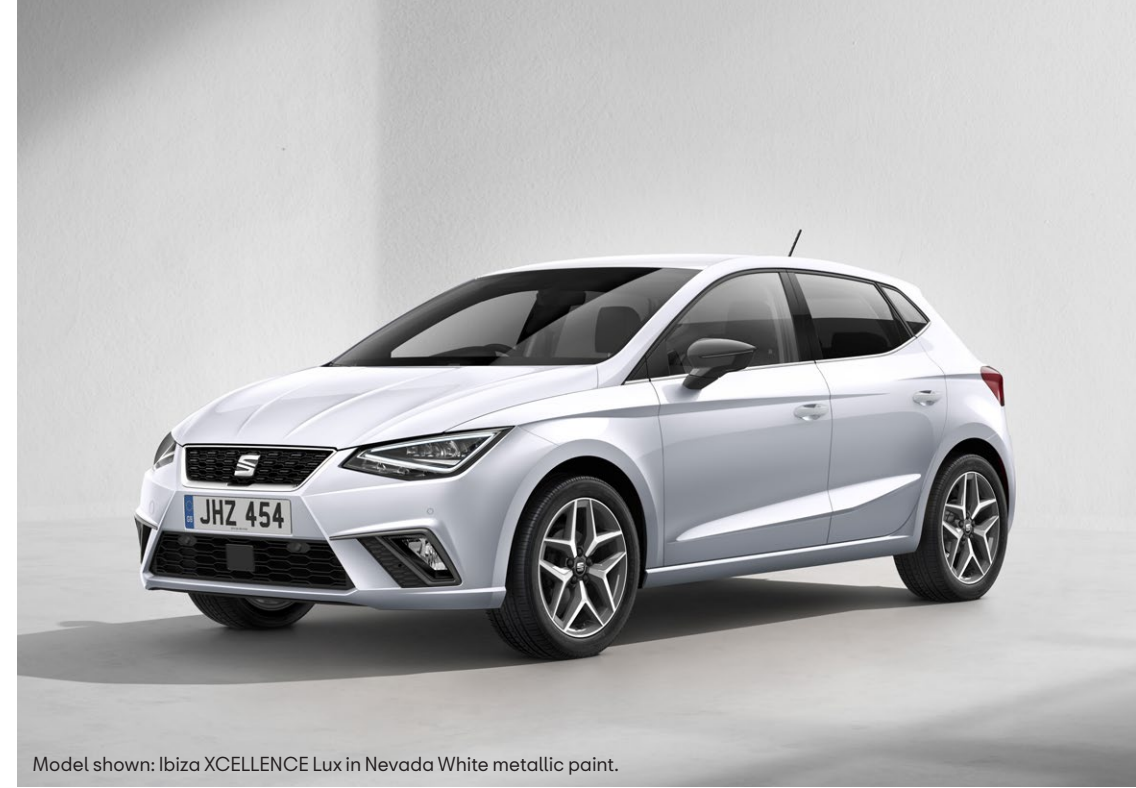
Model shown: Ibiza XCELLENCE Lux in Nevada White metallic paint.

10 The SEAT Ibiza. Pricing and specification list.