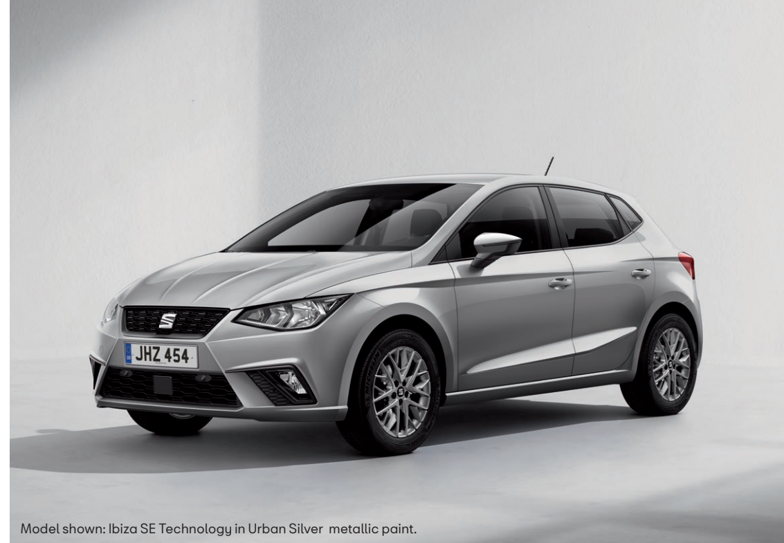
Model shown: Ibiza SE Technology in Urban Silver metallic paint.