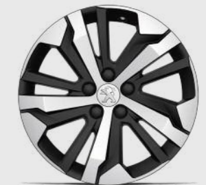
17" 'AORAKI' Alloy Wheel