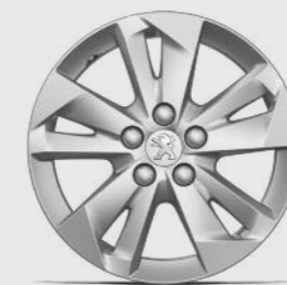
16" 'TARANAKI' Alloy Wheel