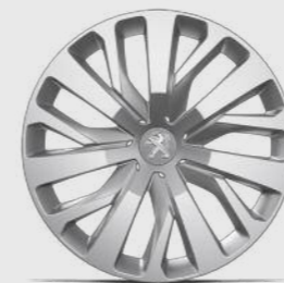
16" Steel Wheel with 'RAKIURA' wheel trim

Your all-new PEUGEOT Rifter comes with a choice of wheels, according to the version you select.