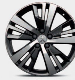
18" 'DETROIT' Two-tone diamond-cut alloy wheels* (standard on Allure versions)