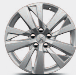
17" 'CHICAGO' alloy (standard on Active versions)

*Optional on Active versions **Optional on Allure versions