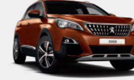
Sunset Copper** (Met)