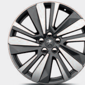
19" 'WASHINGTON' Two-tone diamond-cut alloy wheels (optional on Allure versions)