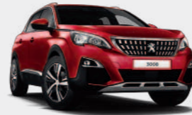
Ultimate Red** (Special)