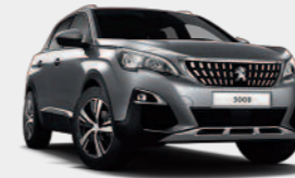
Cumulus Grey** (Met)