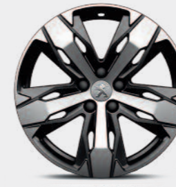
18" 'LOS ANGELES' Two-tone diamond-cut alloy wheels** (linked to Advanced Grip Control®)