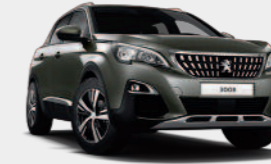
Amazonite Grey** (Met)