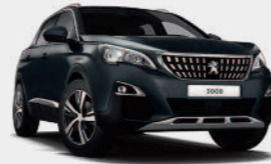
Hurricane Grey* (Solid)