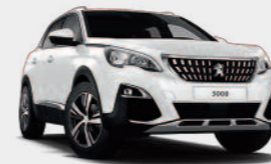
Bianca White** (Solid)