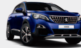
Magnetic Blue** (Met)