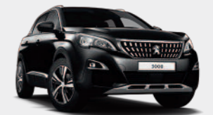
Nero Black** (Met)