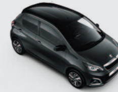
Carbon Grey / Raven Black