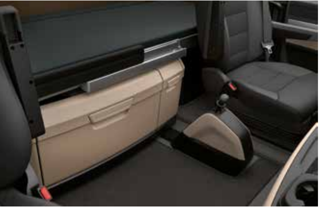
f Stowable coolbox/stowage b

The new coolbox/stowage box with integrated bin can be stowed fully under the bunk. A handy tray can be placed on the box or stored separately, providing a lot of extra space and some comfortable legroom when sitting on the bunk. Nevertheless, the new layout still offers more cooling space and additional storage compartments. The feature that allows cups or ashtrays to be placed on the top has also been optimised: up to four retaining devices can be fixed in the middle, within easy reach of the driver and co-driver.