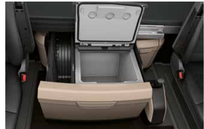
Coolbox/stowage box pulled out