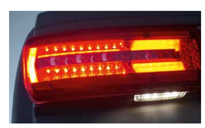
LED rear lights

Early recognition of critical situations on the difficult-to-view right side of the vehicle is essential when turning or manoeuvring. A camera on MAN trucks extends the visible area to the blind spot. The monitor is in the field of vision when looking to the right in the mirror and helps the driver to better view the area next to the vehicle. It recognises whether, for example, cyclists or smaller vehicles are located directly next to the driver's cab and, when manoeuvring, obstacles stand out better. The system is activated automatically whenever the right-hand indicator is switched on. This equipment can be ordered ex works.