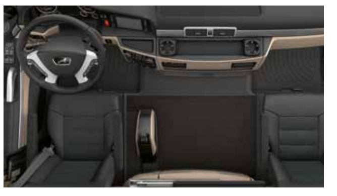
Rearranging the TipMatic switch and parking brake creates additional space