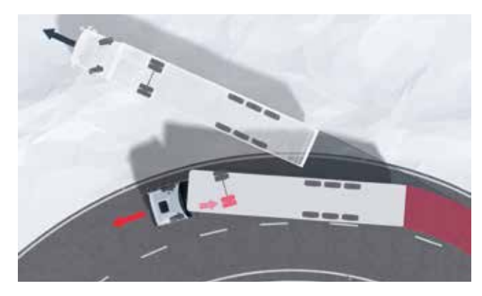
ESP compensatory braking when vehicle is understeered