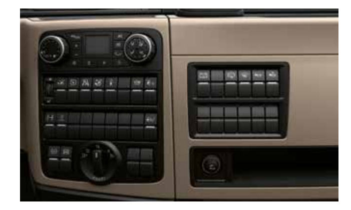
Neat switch layout