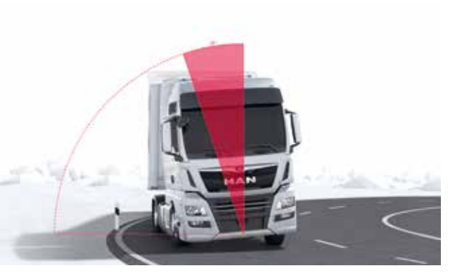
Vehicle behaviour without CDC