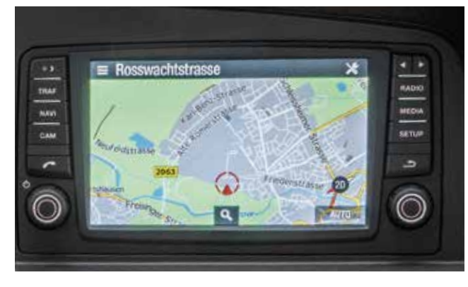
MAN Media Truck Navigation

The new "Mirror Link" function transfers the user interface of mobile devices to the infotainment system, enabling safe operation via the multi-function steering wheel and the system itself (connection via USB cable). The navigation screen also continuously shows maximum speed limitations (dependent on the map data including the respective information). The digital radio (DAB/DAB+) is easy to access and use via voice control.