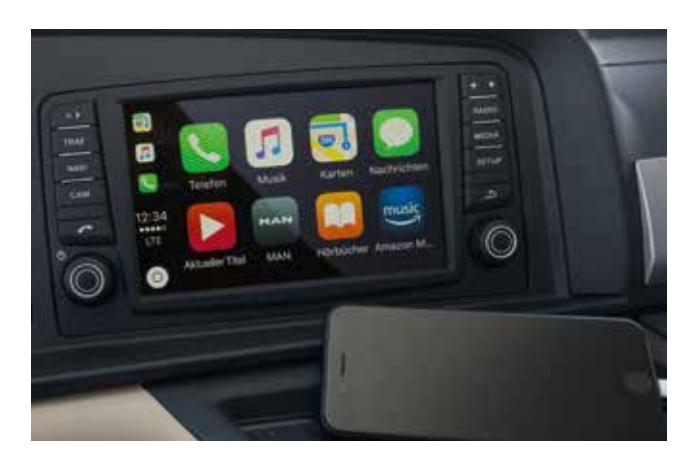
Function "Mirror Link"