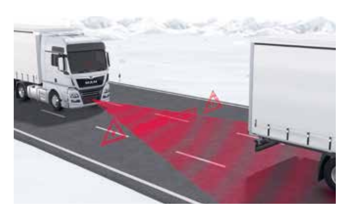
Functional principle EBA: advanced traffic monitoring by using two independent sensor systems (radar and video)

As even a brief moment of distraction can lead to an accident, MAN has developed the anticipatory Emergency Brake Assist (EBA). It gives drivers an advance warning of impending collisions, providing them with valuable time to react. The system automatically initiates braking in an emergency. The optimised Emergency Brake Assist (EBA) features a more advanced traffic monitoring system by using two independent sensor systems (radar and video) to detect a potential collision more quickly and to issue a warning signal as early as possible.