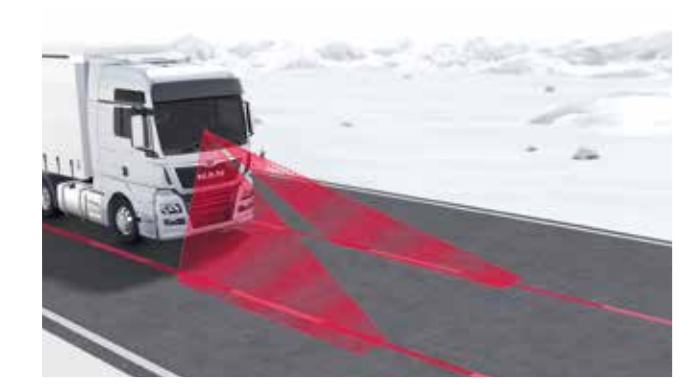
Lane Guard System (LGS) including Lane Return Assist (LRA)