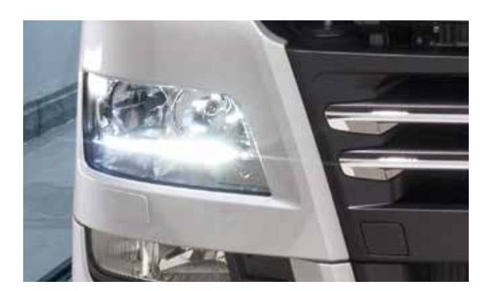
LED daytime driving lights