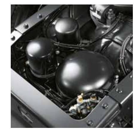
Compressed air tanks situated at the rear