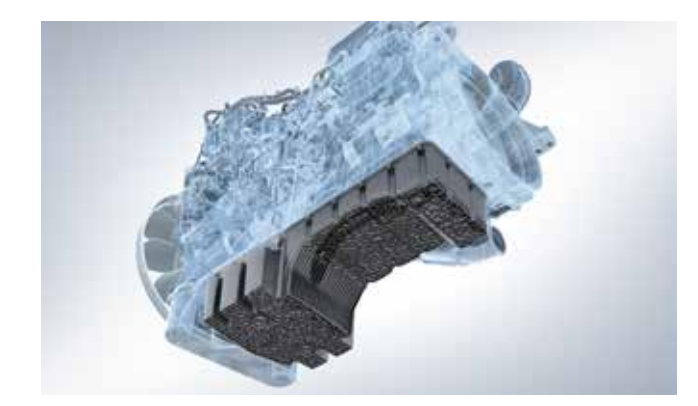
Plastic oil sump to save weight