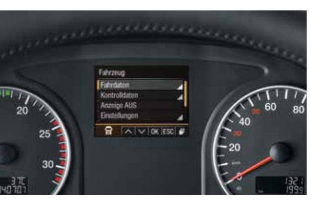
Enhanced colour display in the instrumentation

Comfort and working conditions for the driver have been improved thanks to the reduction in interior noise by 1.5 dB compared to the previous series.