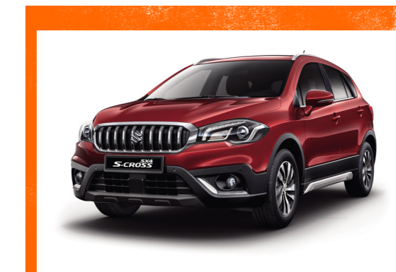
Energetic Red Pearl Metallic