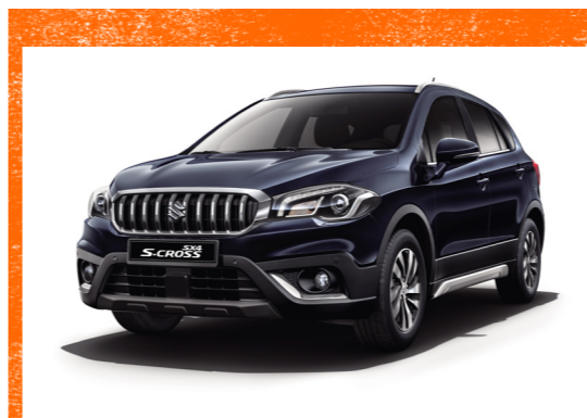
Sphere Blue Pearl Metallic