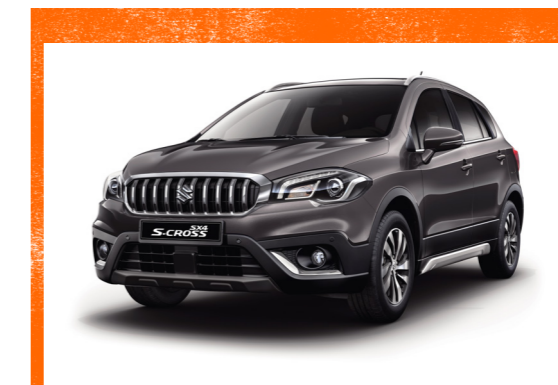
Mineral Grey Metallic