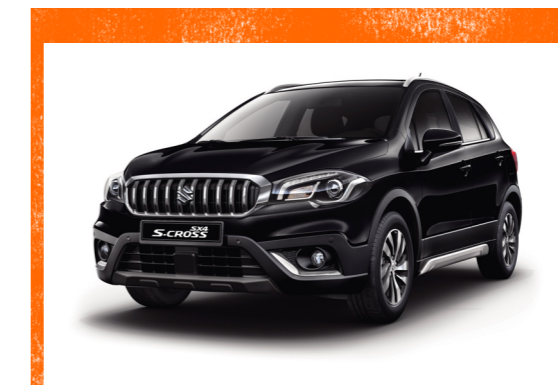
Cosmic Black Pearl Metallic