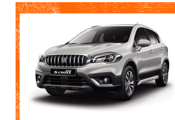
Silky Silver Metallic