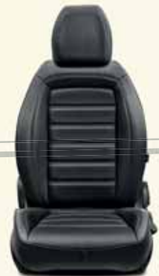
LOUNGE Techno leather (optional) Code 404