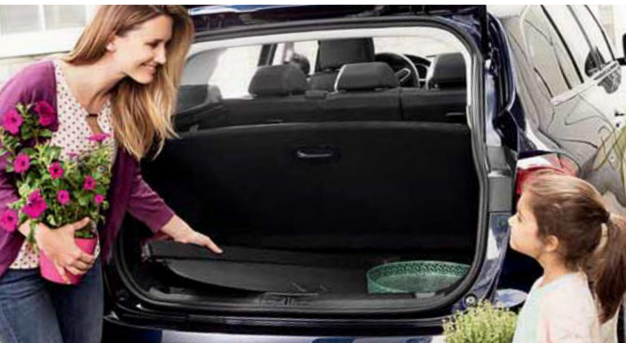
The luggage compartment cover can easily be placed in the Magic Cargo Space.