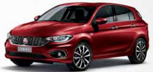
716 TANGO RED METALLIC