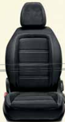
LOUNGE Fabric with horizontal microfiber inserts Code 314