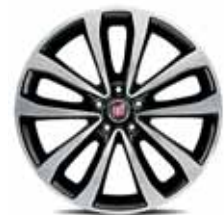
LOUNGE 17" alloy wheels Code 435