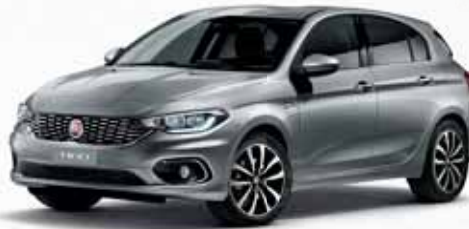
612 MINIMAL GREY METALLIC