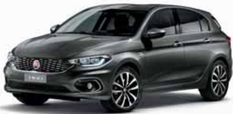
695 ELECTROCLASH GREY METALLIC