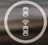
FULL BRAKE CONTROL SYSTEM