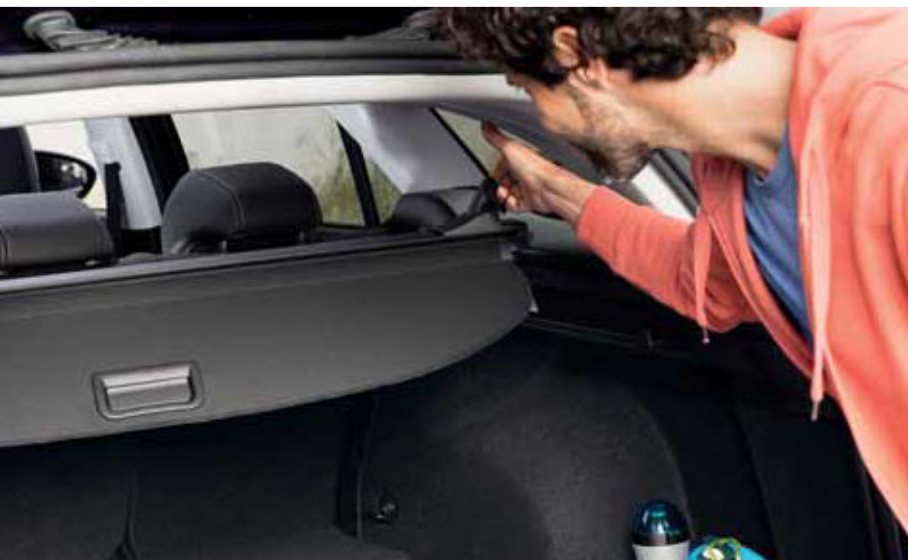
With just one hand, you can easily remove the luggage compartment cover.