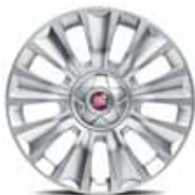
EASY 15" steel wheels with covers Code 406