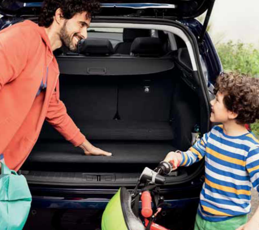
You can increase the height of the luggage compartment by positioning the Magic Cargo Space to the lowest level, using only one hand.