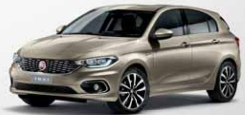
722 PEARL SAND METALLIC