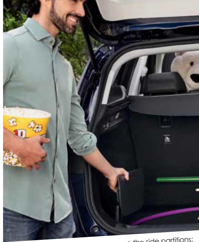
you only need one hand to remove the side partitions: