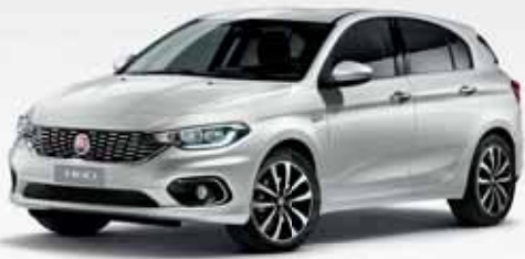
249 AMBIENT WHITE PASTEL