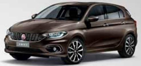
444 MAGNETIC BRONZE METALLIC