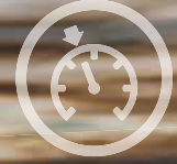
ADAPTIVE CRUISE CONTROL SPEED LIMITER