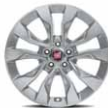
EASY PLUS 16" alloy wheels Code 420