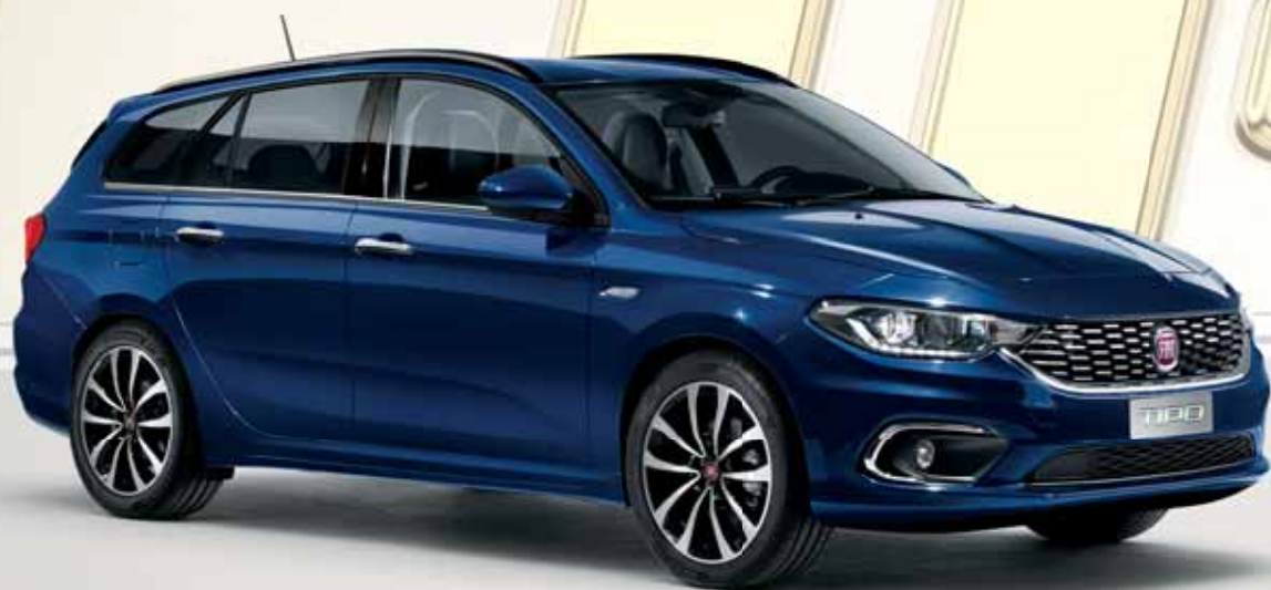
TIPO STATION WAGON