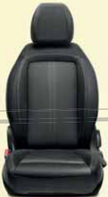
EASY / EASY PLUS Fabric with double vertical stripes Code 015