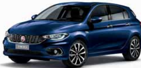
717 ELBA BLUE METALLIC