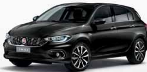
718 VOLCANO BLACK METALLIC