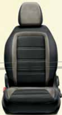
LOUNGE Fabric with horizontal microfiber inserts Code 301