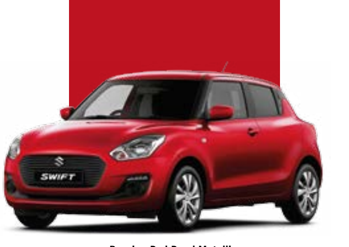
Burning Red Pearl Metallic Available on all models.

Take a look at our range of single and dual-tone colour options, and find the colour that is truly you.