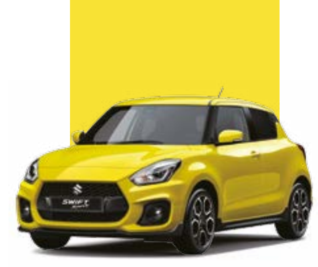
Champion Yellow Available on Swift Sport models only.