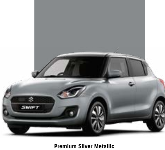
Available on SZ3, SZ-T and SZ5 models only.