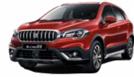
Energetic Red Pearl Metallic