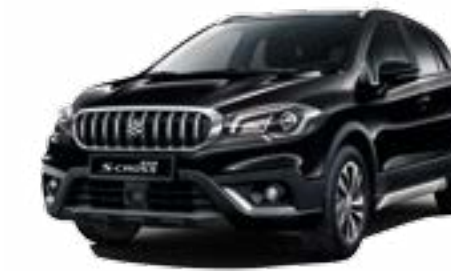
Cosmic Black Pearl Metallic