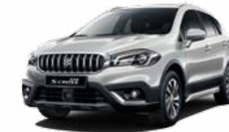
Silky Silver Metallic