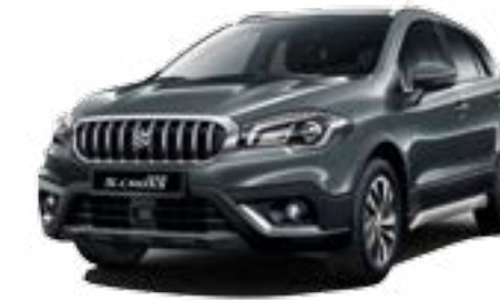
Mineral Grey Metallic