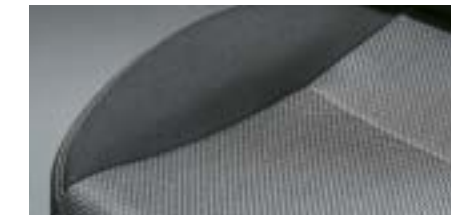
Fabric with silver stitching (SZ-T)