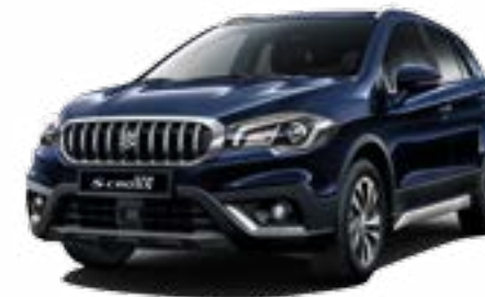
Sphere Blue Pearl Metallic