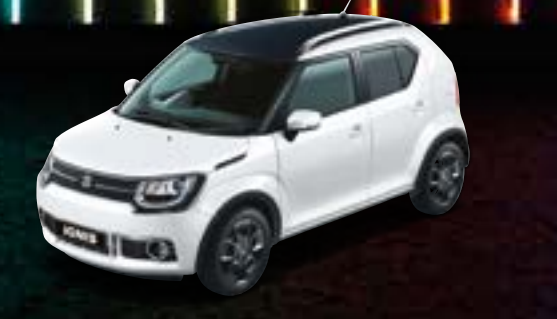
Pure White Pearl Metallic with Super Black Pearl Metallic roof