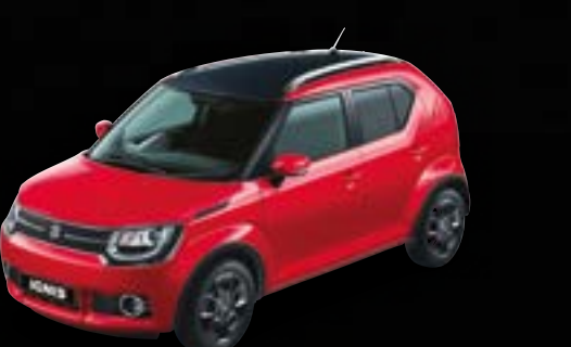
Fervent Red with Super Black Pearl Metallic roof