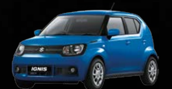
Speedy Blue Metallic Drive into another dimension