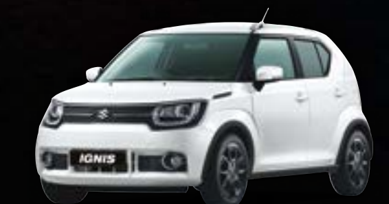
Pure White Pearl Metallic Shine, baby, shine