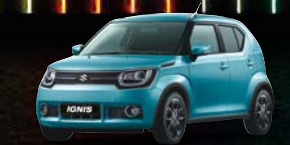
Neon Blue Metallic Be bright as light