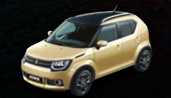
Helios Gold Pearl Metallic with Super Black Pearl Metallic roof