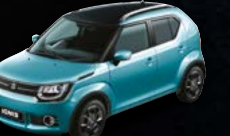
Neon Blue Metallic with Super Black Pearl Metallic roof