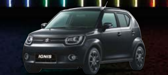
Super Black Pearl Metallic Like a sleek city slicker