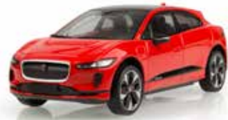
I-PACE 1:43 SCALE MODEL 1:43 scale model of the new Jaguar I-PACE in Photon Red. This detailed diecast model of our first all-electric performance SUV shows the distinctive profile of the car. PHOTON RED £50.00 50JEDC280RDY