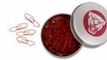
GROWLER PAPERCLIPS AND TIN

Paperclips in a matte finish tin with Jaguar Growler design. Paperclips in the shape of the E-type and the F-TYPE.