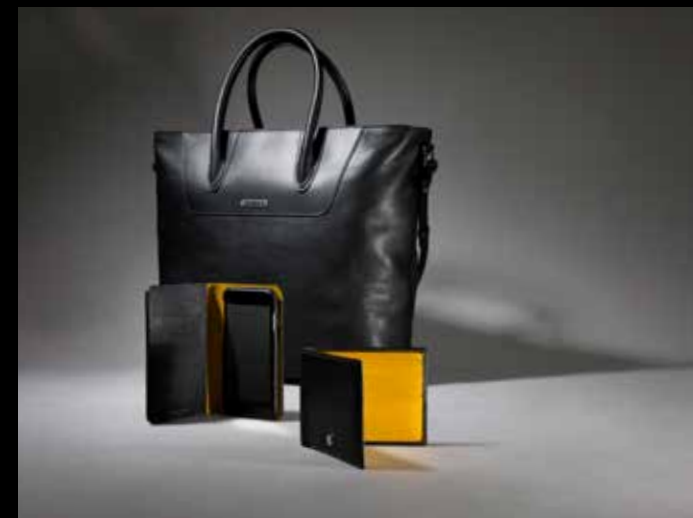
70 ULTIMATE COLLECTION