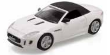
F-TYPE CONVERTIBLE 1:76 SCALE MODEL 1:76 scale model of the F-TYPE convertible in White with a black soft top. WHITE £6.00 50JDDC0020RZ