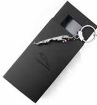
LEAPER KEYRING Keyring with 3D Leaper branded ring slider. SILVER £15.00 50JDKR9275LA