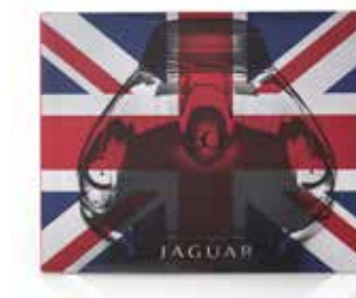
E-TYPE 50-YEAR ANNIVERSARY BOOK Discover the design, the performance and the legacy it left behind. A detailed archive charting 50 years of the iconic Jaguar E-type. £40.00 50JSPAETB