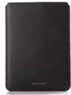
LEATHER IPAD SLIP CASE

Leather slip case to keep iPads protected in style. Featuring foil embossed Jaguar wordmark. iPad Air 2 and Pro 9.7-inch.