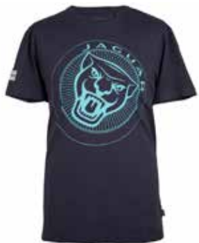
MEN'S LARGE GROWLER GRAPHIC T-SHIRT Cotton crew neck T-shirt. Made from 100% cotton jersey fabric with Growler print to the chest.

GREY MARL £25.00 XS 50JATM003GMB XL 50JATM003GMF S 50JATM003GMC XXL 50JATM003GMG M 50JATM003GMD XXXL 50JATM003GMH L 50JATM003GME XXXXL 50JATM003GM3