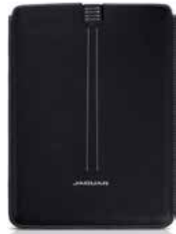
IPAD AIR 2 CASE

iPad case with perforated detailing to the back and leather features beneath. Jaguar wordmark embossed in foil to the front.