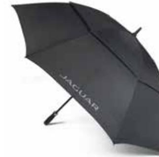
PREMIUM GOLF UMBRELLA Wind tunnel tested to 78mph, this Premium Golf Umbrella in Black features a subtle Jaguar wordmark to the canopy. Comes with a branded cover. BLACK £35.00 50JEUM119BKA