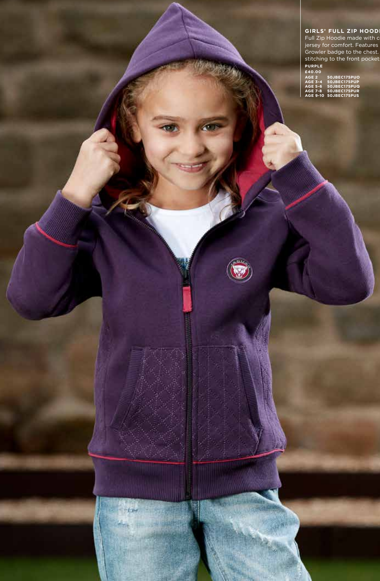
GIRLS' FULL ZIP HOODIE Full Zip Hoodie made with cotton jersey for comfort. Features woven Growler badge to the chest. Diamond stitching to the front pockets. PURPLE £40.00 AGE 2 50JBEC175PUO AGE 3-4 50JBEC175PUP AGE 5-6 50JBEC175PUQ AGE 7-8 50JBEC175PUR AGE 9-10 50JBEC175PUS