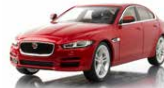
XE 1:43 SCALE MODEL 1:43 collector grade scale model of the Jaguar XE, our most advanced, efficient and refined sports saloon ever, in Italian Racing Red. ITALIAN RACING RED £50.00 50JDCAX760