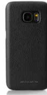
LEATHER SAMSUNG GALAXY PHONE CASE

BLACK £15.00 7+ 50JDPH865BKA 8 50JEPH204BKA 8+ 50JEPH205BKA