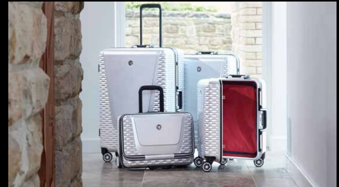
52 GIFTS AND TRAVEL