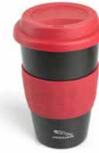
TRAVEL CERAMIC MUG Black, ceramic travel mug with Jaguar wordmark debossed on the silicone grip. Features Jaguar Leaper logo. BLACK £15.00 50JDMG743BKA