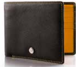
ULTIMATE WALLET Black leather wallet that's understated but unmistakable. Features chrome Growler stud with F-TYPE Performance Yellow stitching interior. Two inner compartments and eight card slots. BLACK £70.00 50JDLG718BKA