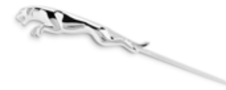
LEAPER LETTER OPENER

Letter Opener with a 3D Leaper and a chrome finish.