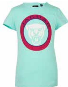
GIRLS' GROWLER GRAPHIC T-SHIRT 100% cotton crew neck T-shirt featuring Growler print, woven side tab and Leaper print on the arm. TURQUOISE £18.00 AGE 2 50JBTC039TUN AGE 3-4 50JBTC039TUP AGE 5-6 50JBTC039TUQ AGE 7-8 50JBTC039TUR AGE 9-10 50JBTC039TUS