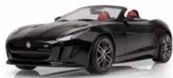
F-TYPE CONVERTIBLE 1:18 SCALE MODEL 1:18 collector grade scale model of the F-TYPE convertible in Black. This diecast model features a striking red interior and is presented on a black plinth. SANTORINI BLACK £100.00 50JDDC996BKW