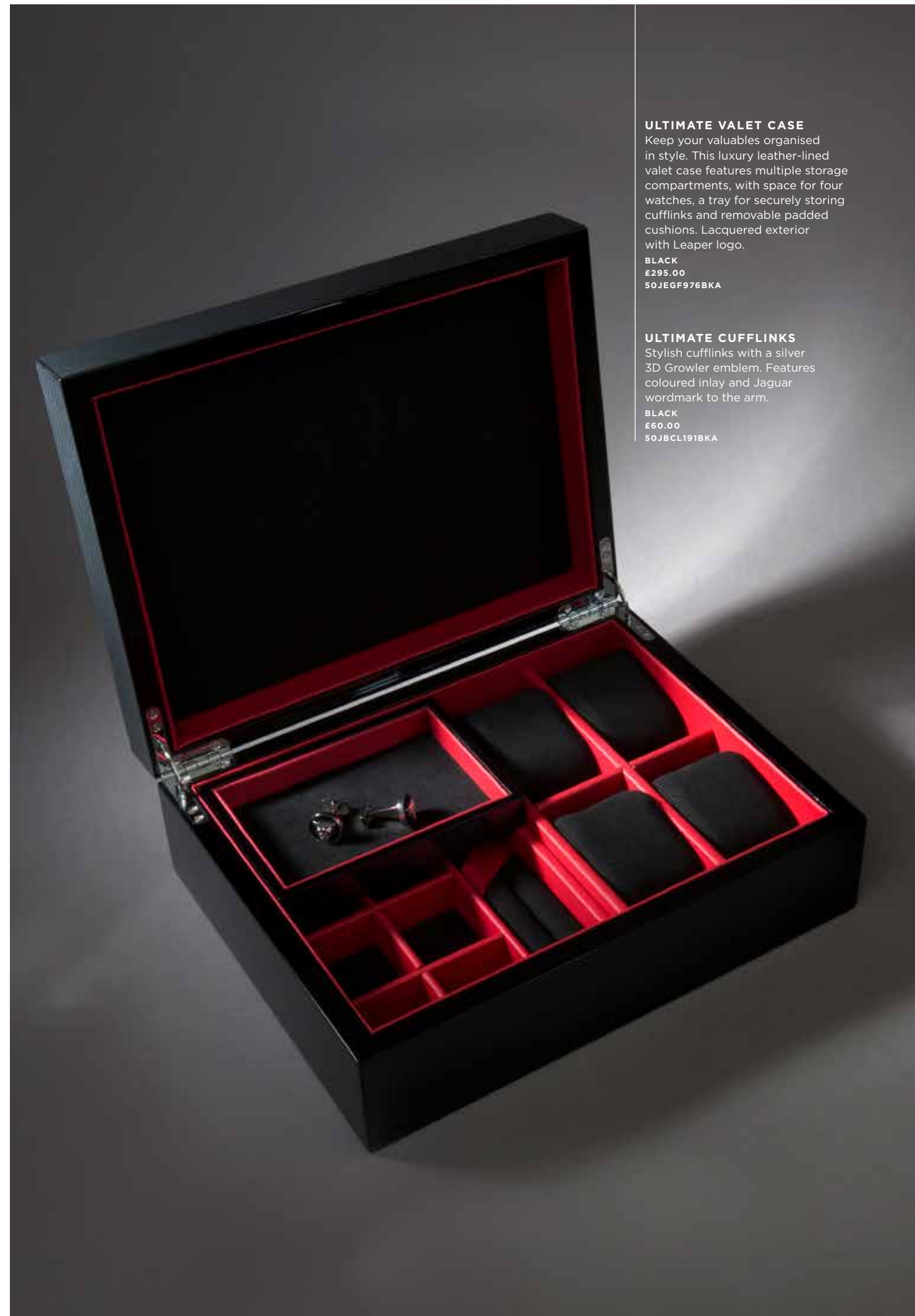
ULTIMATE VALET CASE Keep your valuables organised in style. This luxury leather-lined valet case features multiple storage compartments, with space for four watches, a tray for securely storing cufflinks and removable padded cushions. Lacquered exterior with Leaper logo. BLACK £295.00 50JEGF976BKA