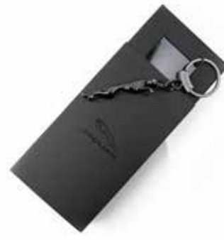
LEAPER KEYRING Keyring with 3D Leaper branded ring slider. GREY MARL £15.00 50JDKR912GMA