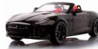
F-TYPE V8 S 1:43 SCALE MODEL 1:43 collector grade diecast of F-TYPE V8 S Convertible, the ultimate version of our contemporary sports car. BLACK £50.00 50JDCAFTV8B