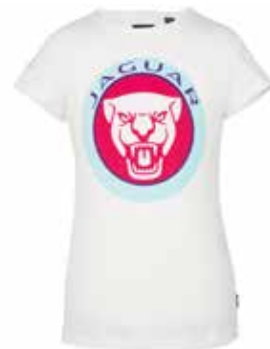
GIRLS' GROWLER GRAPHIC T-SHIRT 100% cotton crew neck T-shirt featuring Growler print, woven side tab and Leaper print on the arm. WHITE £18.00 AGE 2 50JBTC039WTO AGE 3-4 50JBTC039WTP AGE 5-6 50JBTC039WTQ AGE 7-8 50JBTC039WTR AGE 9-10 50JBTC039WTS