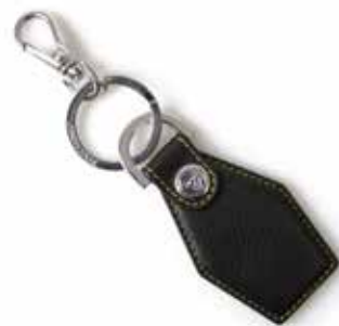
ULTIMATE KEYRING Black leather Keyring with a chrome split ring and ring connector. With contrast Performance Yellow stitching and Growler stud to the front. Jaguar wordmark embossed on the back. BLACK £30.00 50JDKR723BKA