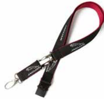
LANYARD Carry your ID with the Jaguar identity. This sleek lanyard in Black features the Leaper logo to the front with a contrast red reverse. BLACK £5.00 50JEGF745BKA