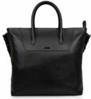
ULTIMATE LEATHER TOTE BAG Textured Black Leather Tote Bag. Three interior pockets. Removable shoulder strap. Metal Jaguar wordmark plaque to the front. W 54CM H 4.5CM D 64CM BLACK £295.00 50JDLX890BKA