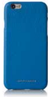
LEATHER IPHONE CASE 100% Leather iPhone Case. Features foil embossed Jaguar wordmark to the back.

BLACK £30.00 6 50JDPH726BKA 6+ 50JDPH727BKA 7 50JDPH859BKA 7+ 50JDPH860BKA 8 50JEPH208BKA 8+ 50JEPH209BKA