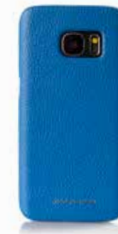
LEATHER SAMSUNG GALAXY PHONE CASE

Leather Samsung Galaxy S7 phone case. Features foil embossed Jaguar wordmark.