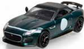
PROJECT 7 1:76 SCALE MODEL 1:76 scale model of the Jaguar Project 7. This detailed diecast is more than worthy of the fastest Jaguar ever made, with British Racing Green finish and race markings. BRITISH RACING GREEN £6.00 50JDDC973GNZ