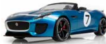
PROJECT 7 1:18 SCALE MODEL The collector edition Project 7 F-TYPE sports car recreated in a finely detailed Ecurie Blue diecast model. 1:18 scale. ECURIE BLUE £100.00 50JDDC030BLW