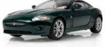
JAGUAR XK COUPE 1:24 SCALE MODEL 1:24 scale detailed diecast model of the XK Coupe in Silver, with an intricate recreation of the monocoque bodyshell. BRITISH RACING GREEN £15.00 50JDCAWELXKCG