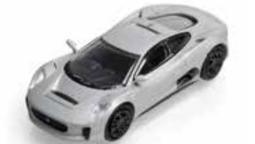
C-X75 1:76 SCALE MODEL 1:76 scale model of the C-X75 concept car in Silver. Debuted in 2010, this hybrid electric vehicle was featured in Spectre, the 24th instalment of the James Bond film series. SILVER £6.00 50JDDC974SLZ