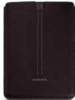
IPAD AIR 2 CASE

iPad case with perforated detailing to the back and leather features beneath. Jaguar wordmark embossed in foil to the front.