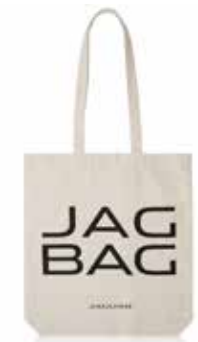
CANVAS TOTE BAG

Carry the Jaguar name with you everywhere. 100% cotton reusable Canvas Tote Bag featuring Jag Bag print to the front.