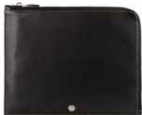
ULTIMATE iPad CASE Black leather iPad Case branded with the Growler stud. Includes spacious compartments for an iPad and an additional internal zipped pocket. Interior features Performance Yellow contrast details. BLACK £90.00 50JDLG889BKA