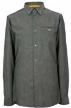
MEN'S CHAMBRAY SHIRT A classic shirt in Grey chambray. Features a welted pocket to the chest and subtle Performance Yellow detailing. Jaguar Leaper tab and blue contrast side tabs.

GREY £45.00 XS 50JCSM309GYB XL 50JCSM309GYF S 50JCSM309GYC XXL 50JCSM309GYG M 50JCSM309GYD XXXL 50JCSM309GYH L 50JCSM309GYE XXXXL 50JCSM309GY3