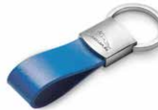
LEATHER LOOP KEYRING Brushed metal keyring with leather loop. Pull and twist key lock mechanism. BLUE £15.00 50JKRALLKBL