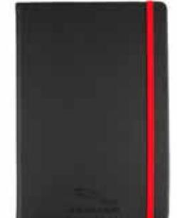
NOTEBOOK LARGE A5

A5 Leaper branded notebook with Leaper logo on every page. 96 sheets. 93gsm paper.