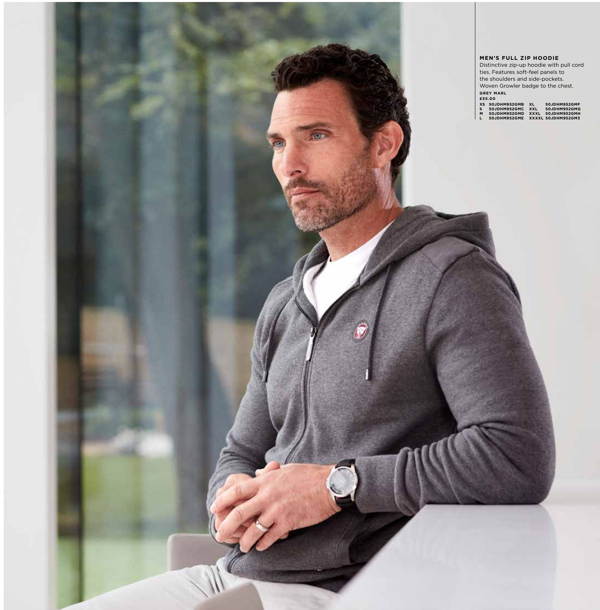
MEN'S FULL ZIP HOODIE Distinctive zip-up hoodie with pull cord ties. Features soft-feel panels to the shoulders and side-pockets. Woven Growler badge to the chest.

WHITE £25.00 XS 50JBTM029WTB XL 50JBTM029WTF S 50JBTM029WTC XXL 50JBTM029WTG M 50JBTM029WTD XXXL 50JBTM029WTH L 50JBTM029WTE