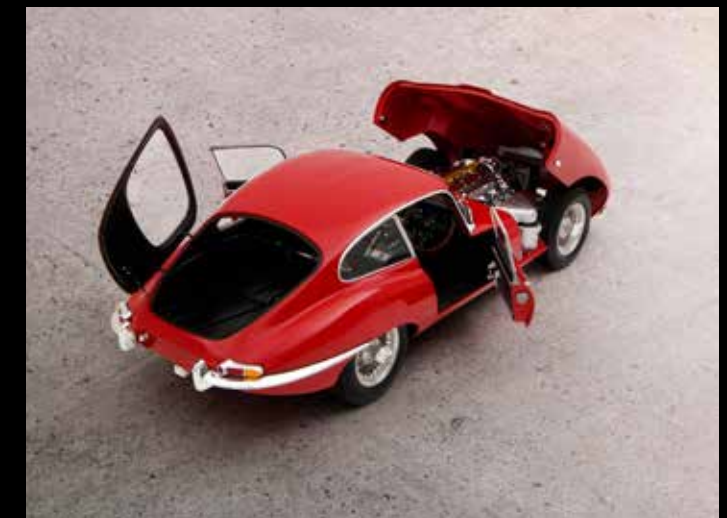
74 SCALE MODELS