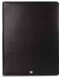
ULTIMATE PORTFOLIO Black leather Portfolio case. Performance Yellow contrast details, spacious compartments for a tablet or notebook, card slots and an internal zipped pocket. Growler stud to the front. BLACK £195.00 50JDLG719BKA