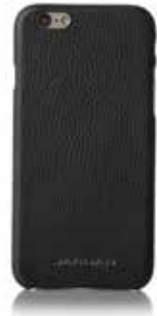
LEATHER IPHONE CASE 100% Leather iPhone Case. Features foil embossed Jaguar wordmark to the back.

BLACK £30.00 6 50JDPH726BKA 6+ 50JDPH727BKA 7 50JDPH859BKA 7+ 50JDPH860BKA 8 50JEPH208BKA 8+ 50JEPH209BKA