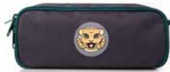
CHILDREN'S PENCIL CASE Children's Pencil Case with Jaguar Cub graphic, zip compartment and front pocket. GREY £7.00 ONE SIZE 50JDGF833GYA