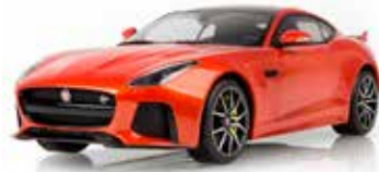
F-TYPE SVR COUPE 1:18 SCALE MODEL 1:18 collector grade scale model of the F-TYPE SVR Coupe in Firesand. Finely crafted from resin, this model shares the stunning lines of our fastest and most powerful F-TYPE. FIRESAND £100.00 50JDDC029ORW