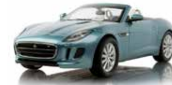
F-TYPE V8 S 1:43 SCALE MODEL 1:43 collector grade diecast of F-TYPE V8 S Convertible, the ultimate version of our contemporary sports car. GREY £50.00 50JDCAFT