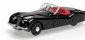
JAGUAR XK120 1:76 SCALE MODEL 1:76 scale model of the XK120, the iconic sports car produced by Jaguar between 1948-1956, in Black. Featuring spats to the rear wheel arches. BLACK £6.00 50JBDC564BKA