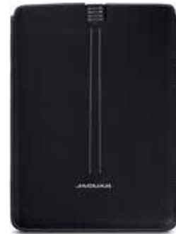
LEATHER TABLET SLIP CASE

Smooth Leather Tablet Slip Case featuring foil embossed Jaguar wordmark in Black. Suitable for Samsung Galaxy or iPad tablet.