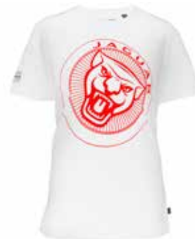
MEN'S LARGE GROWLER GRAPHIC T-SHIRT Cotton crew neck T-shirt. Made from 100% cotton jersey fabric with Growler print to the chest.

NAVY £25.00 XS 50JATM003NVB XL 50JATM003NVF S 50JATM003NVC XXL 50JATM003NVG M 50JATM003NVD XXXL 50JATM003NVH L 50JATM003NVE XXXXL 50JATM003NV3