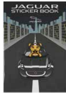
STICKER BOOK Jaguar branded children's sticker book. Features old and new Jaguar vehicles and Jaguar Cub character stickers. £5.00 50JDGF908NAA