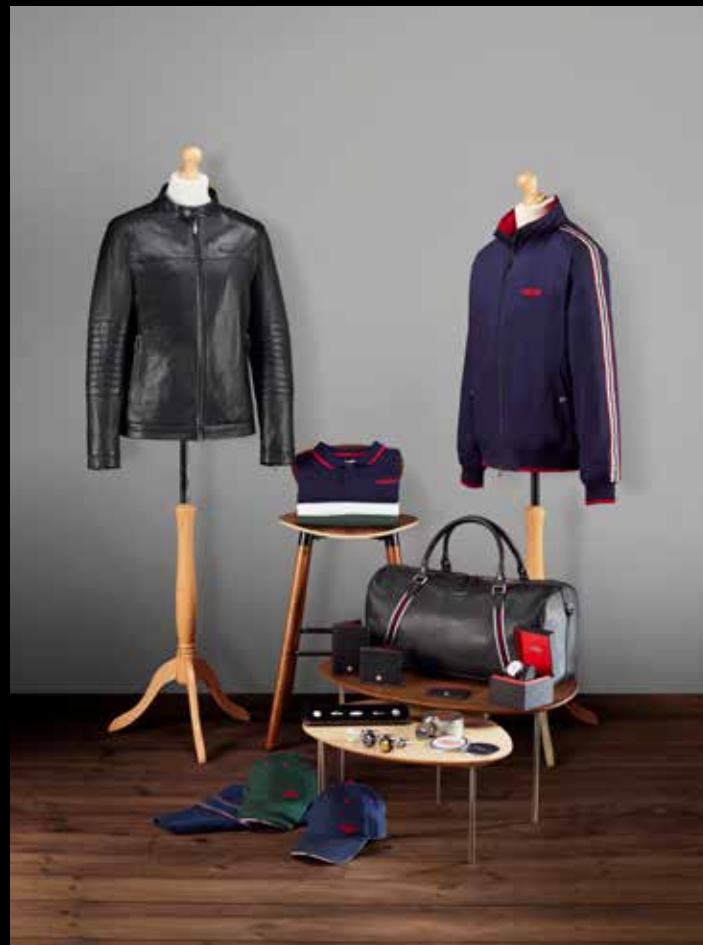
22 HERITAGE COLLECTION