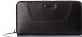
ULTIMATE PURSE Black leather purse with Jaguar wordmark plaque and Performance Yellow contrast detailing. Features a central zipped pocket, eight card slots and two banknote compartments. BLACK £95.00 50JDLG888BKA