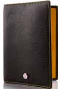
ULTIMATE PASSPORT HOLDER Textured Black leather Passport Holder. Featuring Performance Yellow trim, Growler stud and debossed Jaguar wordmark. BLACK £60.00 50JDLG720BKA