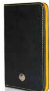
ULTIMATE LEATHER iPhone WALLET CASE Black leather iPhone Wallet Case with chrome Growler stud. Features Performance Yellow stitching and contrasting interior with space for three cards. BLACK £70.00 8 50JEPH214BKA 8+ 50JEPH215BKA