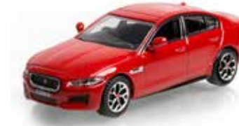
XE 1:76 SCALE MODEL 1:76 scale model of the Jaguar XE, our most advanced, efficient and refined sports saloon ever, in Italian Racing Red. ITALIAN RACING RED £6.00 50JDDC972RDZ