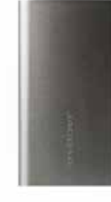
USB BATTERY POWER CHARGER

Silver Jaguar wordmark branded USB power charger with aluminium casing. 4000mAh. Power for two full smartphone charges. Flat USB charger included.