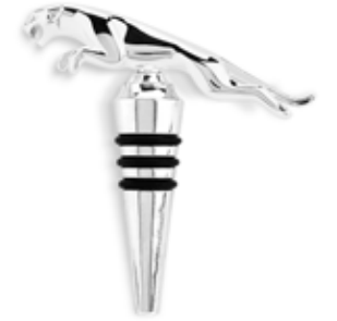
LEAPER BOTTLE STOPPER Elegant chrome Bottle Stopper crowned with 3D Leaper badge. Features three rubber bottleneck bands. Suitable for a wide range of bottle types and sizes. SILVER £25.00 50JBGF2025LA