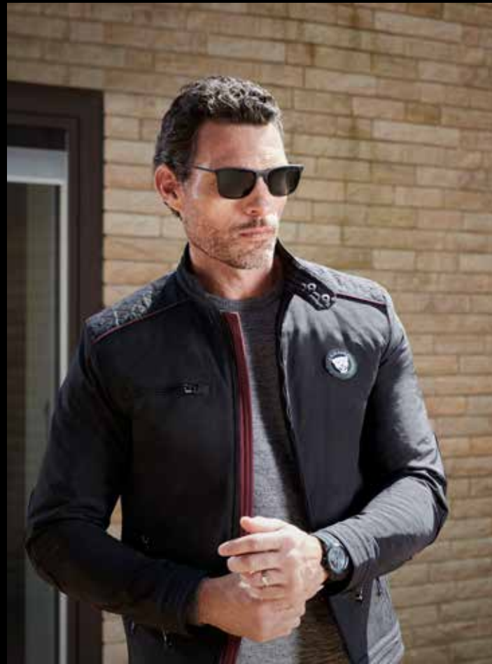
06 MEN'S APPAREL AND ACCESSORIES