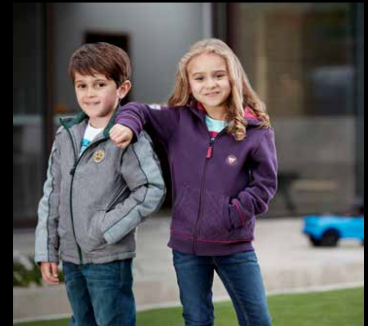
42 JAGUAR JUNIORS