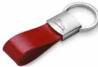
LEATHER LOOP KEYRING Brushed metal keyring with leather loop. Pull and twist key lock mechanism. RED £15.00 50JDKR915RDA