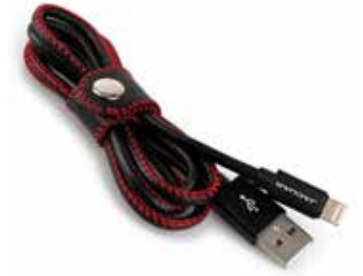
LEATHER WRAPPED IPHONE CABLE

Black Leather Wrapped iPhone Cable with Red contrast stitching. MFI approved.