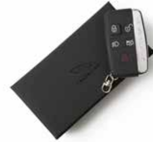
JAGUAR KEY FOB USB 16GB

16GB USB fob based on a modern Jaguar key. Made to the key specification, this replica is entirely accurate in terms of size, colour and material.