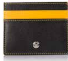
ULTIMATE CARD CASE Black leather Card Case. Features Performance Yellow contrast details, centre compartment and four card slots. Chrome Growler stud to the front and embossed Jaguar wordmark to the back. BLACK £45.00 50JDLG717BKA