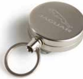
RETRACTABLE LANYARD Silver retracting cord lanyard with belt hook and Leaper branding. SILVER £6.00 50JDGF9595LA