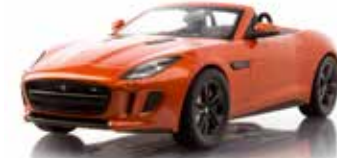
F-TYPE V8 S 1:43 SCALE MODEL 1:43 collector grade diecast of F-TYPE V8 S Convertible, the ultimate version of our contemporary sports car. FIRESAND £50.00 50JDCAFTV8