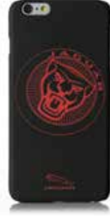
GROWLER GRAPHIC IPHONE CASE

BLUE £30.00 6 50JDPH726BLA 6+ 50JDPH727BLA 7 50JDPH859BLA 7+ 50JDPH860BLA