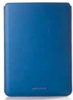
LEATHER IPAD SLIP CASE

Leather slip case to keep iPads protected in style. Featuring foil embossed Jaguar wordmark. iPad Air 2 and Pro 9.7-inch.