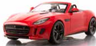
F-TYPE V8 S 1:43 SCALE MODEL 1:43 collector grade diecast of F-TYPE V8 S Convertible, the ultimate version of our contemporary sports car. RED £50.00 50JDCAFTV8R