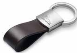
LEATHER LOOP KEYRING Brushed metal keyring with leather loop. Pull and twist key lock mechanism. BLACK £15.00 50JDKR916BKA