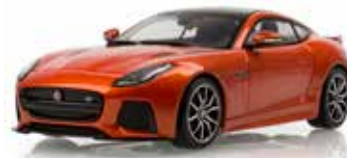
F-TYPE SVR COUPE 1:43 SCALE MODEL 1:43 collector grade scale model of the F-TYPE SVR Coupe in Orange. A highly accurate diecast of our fastest and most powerful F-TYPE. ORANGE £50.00 50JDDC0010RY