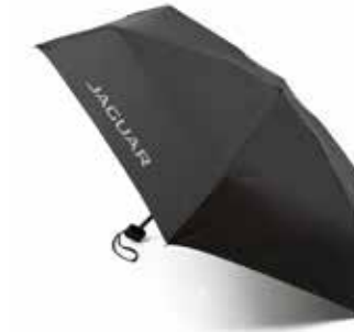
POCKET UMBRELLA Handy travel umbrella. Automatic open and close feature. Aluminium construction with a soft-touch handle. BLACK £25.00 50JEUM121BKA