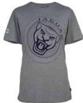
MEN'S LARGE GROWLER GRAPHIC T-SHIRT Cotton crew neck T-shirt. Made from 100% cotton jersey fabric with Growler print to the chest.

GREY £45.00 XS 50JCSM309GYB XL 50JCSM309GYF S 50JCSM309GYC XXL 50JCSM309GYG M 50JCSM309GYD XXXL 50JCSM309GYH L 50JCSM309GYE XXXXL 50JCSM309GY3