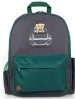
CHILDREN'S RUCKSACK The tiny traveller's friend. Rucksack featuring Jaguar Cub Car graphic, with contrast front pocket. Comfortable, adjustable straps and three zip compartments. GREY £20.00 ONE SIZE 50JDBC831GYA