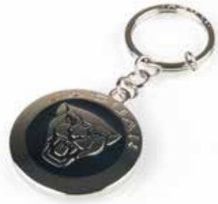
GROWLER KEYRING Keyring with Growler logo and debossed Jaguar wordmark. BLACK £20.00 50JAKR274BKA