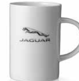
LEAPER LOGO MUG Fine bone china mug branded with Jaguar Leaper logo. WHITE £12.00 50JRCORPMUG14