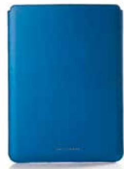
LEATHER SAMSUNG GALAXY TABLET CASE

Leather slip case specifically designed for Samsung tablet. Featuring a foil embossed Jaguar wordmark.