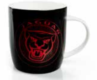
GROWLER GRAPHIC MUG Branded ceramic mug featuring Jaguar Growler. Microwave and dishwasher safe. BLACK £12.00 50JDMG983BKA