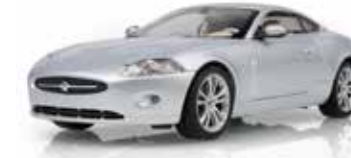
JAGUAR XK COUPE 1:24 SCALE MODEL 1:24 scale detailed diecast model of the XK Coupe in Silver, with an intricate recreation of the monocoque bodyshell. SILVER £15.00 50JDCAWELXKCS