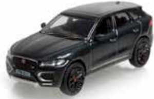
F-PACE 1:76 SCALE MODEL 1:76 scale model of the F-PACE, the first ever Jaguar SUV, in Santorini Black. SANTORINI BLACK £6.00 50JDDC971BKZ