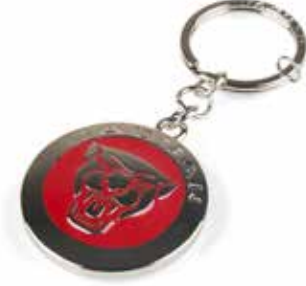
GROWLER KEYRING Keyring with Growler logo and debossed Jaguar wordmark. RED £20.00 50JAKR274RDA