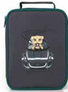
CHILDREN'S LUNCH BOX Children's Lunch Box with carry handle and Jaguar Cub car graphic. GREY £10.00 ONE SIZE 50JDGF832GYA