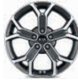
18" Alloy Wheels 235/45R18