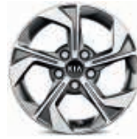
16" Alloy Wheels 205/60R16